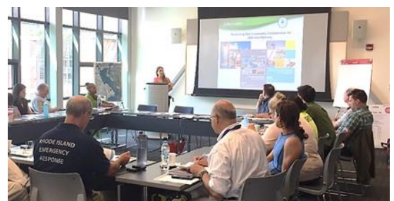
Figure 14: Port-of Providence Working Group Meeting.