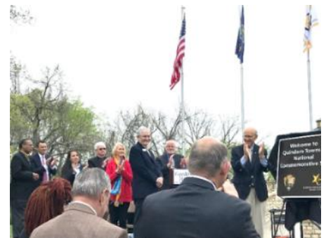
Figure 4: The Quindaro Townsite Designation Ceremony.

EPA and the National Park Service (NPS) have partnered with local community organizations on the Quindaro Townsite (also known as the Quindaro Ruins Underground Railroad site). NPS designated the Quindaro Townsite as a national commemorative site after more than 20 years of advocacy by local champions in Kansas City, Kansas. The site is one of the largest underground railroad sites in the country. The designation was celebrated in FY 2019 by the community along with local, state, and federal officials. NPS will fund the site improvements and Region 7 EJ and Brownfields staff are currently assisting with redevelopment planning and site assessment work.