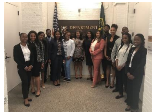
Figure 11: EJA participants at Tennessee State University.

The EJA equips graduates with capacity-building tools they can utilize in their community to comprehensively address the challenges they face. The first pilot-modified approach was tested by Atlanta Metropolitan State College (AMSC), in partnership with the Greater Atlanta Regional Centre of Excellence and the Center for Sustainable Communities (CSC). Ten participants representing local nonprofit organizations, collegiate and graduate-level students, graduated in March 2019. The second class utilizing the pilot-modified approach was tested by Tennessee State University through a grant