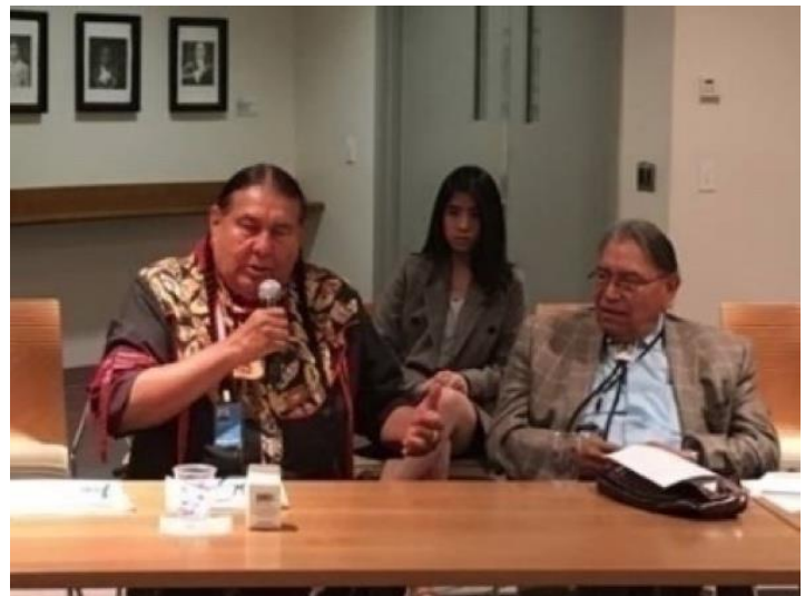
Figure 8: Indigenous Organization Representatives at the USG Side Event on Traditional Knowledge.

The U.S. Government (USG) Delegation for the United Nations 2019 Permanent Forum on Indigenous Issues 47 (UNPFII) consisted of representatives from the Advisory Council on Historic Preservation (ACHP), U. S. Department of State, U.S. Department of Agriculture/Forest Service (FS), U.S. Agency for International Development and EPA. The USG participated in the plenary sessions held April 22 – 25, and several of the UNPFII side events 48 . The USG prepared two official statements for the UNPFII. One statement was on indigenous languages, the focus of the first day. The second statement was on Traditional Knowledge 49 (TK), which was the primary theme of the 2019 UNPFII. The USG statement 50 included a reference to EPA's policies pertaining to TK and also indicated that EPA and ACHP recently collaborated on TK training for both agencies.