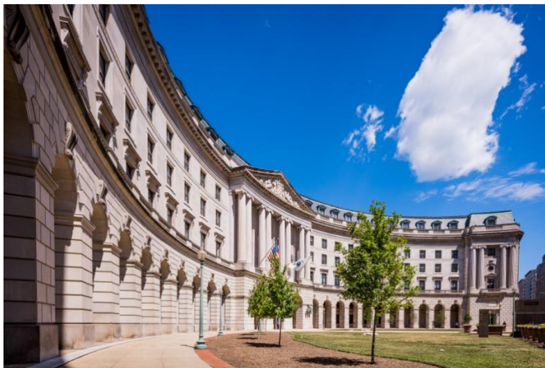
EPA headquarters in Washington, D.C.

- EPA Administrator Andrew Wheeler (August 2018)