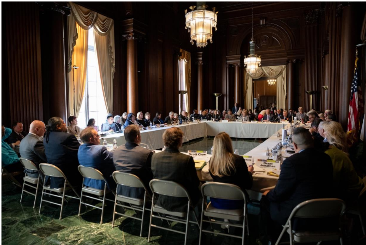
EPA Administrator Andrew Wheeler hosts the National Tribal Operations Committee Meeting at EPA headquarters in Washington, D.C.

Cleanup Process 53 (2017), and EPA Region 10's TK principles (2018). Tribal and indigenous US-based organizations, including the Sevenths Generation Fund, Native American Rights Fund, Indigenous Environmental Network, International Indian Treaty Organization, were represented. Participants also included international indigenous organizations, such as the UN Expert Mechanism on the Rights of Indigenous Peoples, and a few tribal government leaders and representatives, including from the Chickaloon Village of Alaska and Navajo Nation.