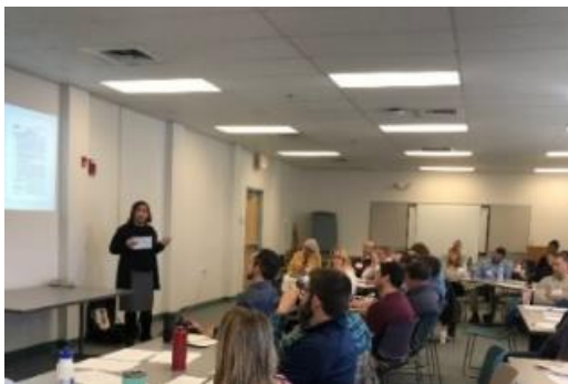
Figure 5: R1 EPA conducting a presentation for RIDEM.

EPA Region 1 and state partners work together to identify areas for collaboration and partnership. A tool integral for identifying and planning these collaborations is state Performance Partnership Agreements 43 . In these agreements, EPA and its state partners identified training on EJ and Title VI of the Civil Rights Act as a state need. EPA Region 1 kicked off a planned series of EJ and Title VI trainings for the six New England states in partnership with the Rhode Island Department of Environmental Management (RIDEM). The nature and purpose of the RIDEM EJ workshop was to further the mutual environmental goals of RIDEM and EPA Region 1.