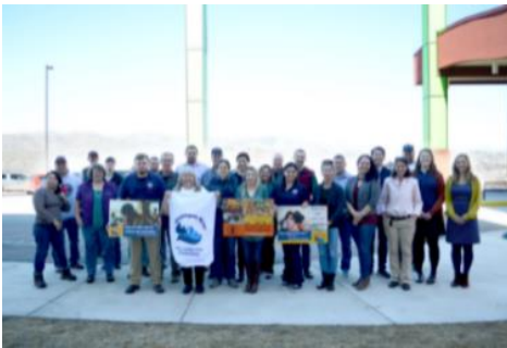
Figure 6: March 2019 ORAP Meeting on Colville Reservation.

To raise awareness and reduce high levels of PM 2.5 , EPA Region 10 and the Confederated Tribes of the Colville Reservation convened the Okanogan River Airshed Partnership (ORAP) in the State of Washington. This dynamic group brings together 25 organizations and over 90 individuals to collaboratively implement innovative, non-regulatory solutions. The Okanogan Valley’s predominate rural population falls in the low-income bracket, relying on low-cost or no-cost means to dispose of debris and heat their homes, and one-third of the community identify as mostly Hispanic and Native American.