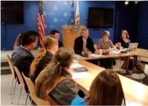
Figure 9: Federal Panelists (US Forest Service, EPA, ACHP) at USG Side Event.

A USG Traditional Knowledge (TK) side event was held in FY 2019, as part of the Eighteenth Session of the Permanent Forum on Indigenous Issues. The meeting was hosted by the U.S. Department of State at the USG United Nations Mission. Approximately 25 tribal leaders and indigenous organization representatives attended. The side event 51 included panelists from the ACHP, EPA's OEJ, and the FS. The ACHP focused on their authorizing federal laws, regulations, and recent policy developments in TK. EPA highlighted current policies related to TK, such as the EPA Policy on Environmental Justice for Working with Federally Recognized Tribes and Indigenous Peoples 52 (2014) – Principles 6 and 7, and the OLEM Memorandum – Considering Traditional Ecological Knowledge during the