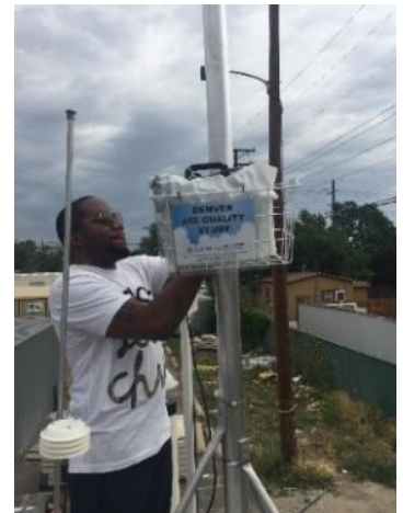
Figure 2: Groundwork Denver community members deploying and retrieving particulate matter (PM) air pollution monitors.