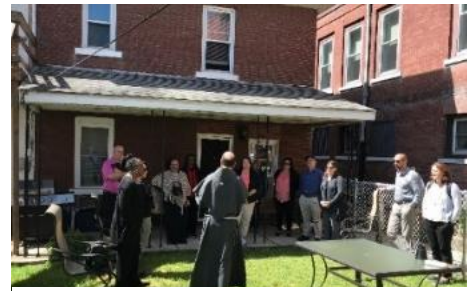
Figure 3: IIC members visiting Shamokin, PA, to hear from community and faith leaders on efforts and needs to rebuild the city.

In FY 2019, EPA formed the Federal Interagency Interfaith Collaboration for Vulnerable Communities (IIC) to enhance federal support for interfaith collaborations to address the needs of vulnerable and underserved communities. The IIC is comprised of representatives of the U.S. Departments of Agriculture, Justice, Labor, Homeland Security, Interior/Fish and Wildlife Service, General Services Administration and EPA. This effort recognizes that oftentimes faith leaders and faith-based organizations serve an important role in underserved and overburdened communities and operates under the authority of two presidential executive orders - Faith and Opportunity Initiative 40 (FOI) (2018) and Federal Actions to Address Environmental Justice in Minority Populations and Low-Income Populations (1994). The FOI recognizes that faith-based and community organizations serve individuals, families, and communities differently than government and are essential to revitalizing communities; and welcomes opportunities for government to partner with faith-based organizations through innovative, measurable and outcome-driven initiatives. Through current work in Shamokin, Pennsylvania, and the collective experiences of agencies in other communities, the IIC seeks to identify best practices to enhance federal agencies' work with interfaith collaborative partnerships to revitalize communities.