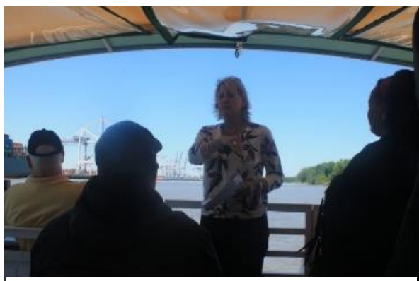
Figure 1: Boat tour of port in Savannah, Georgia.

EPA's Office of Air and Radiation (OAR), in partnership with OEJ and Regional Offices, continued to deliver on-site technical assistance services to ultimately enhance environmental performance of ports and to improve environmental conditions for nearby communities during FY 2019. Under this partnership, the Near-port Community Capacity Building Project 7 marked another significant milestone in FY 2019 as closing activities were conducted for pilot projects located in four U.S. cities: New Orleans, Louisiana; Savannah, Georgia; Seattle, Washington; and Providence, Rhode Island.