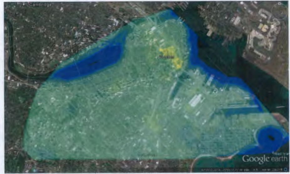
Radiation Exposure Contour Map