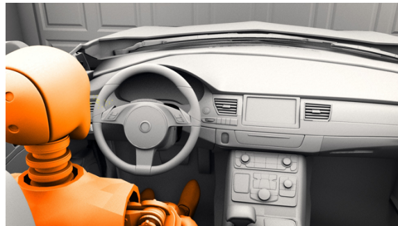
Figure 2 Touch-based DADSS System Illustration

The touch-based system measures blood alcohol levels by shining an infrared-light through the fingertip of the driver. It is being designed to be integrable into current vehicle controls, such as the starter button or steering wheel, and take multiple, accurate readings.