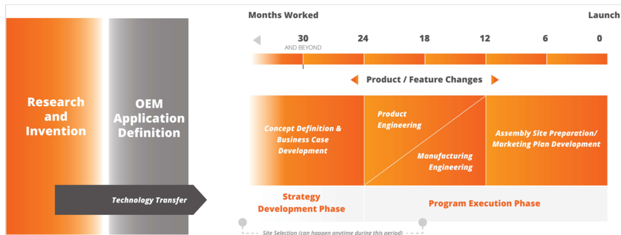
Figure 6 Automotive innovation and technology transfer in relation to product development process.

the touch-based technology by 2024 (GEN 5.0). Should the authorization be enhanced , we estimate that the release of the private vehicle derivative could be pulled ahead one to two years.