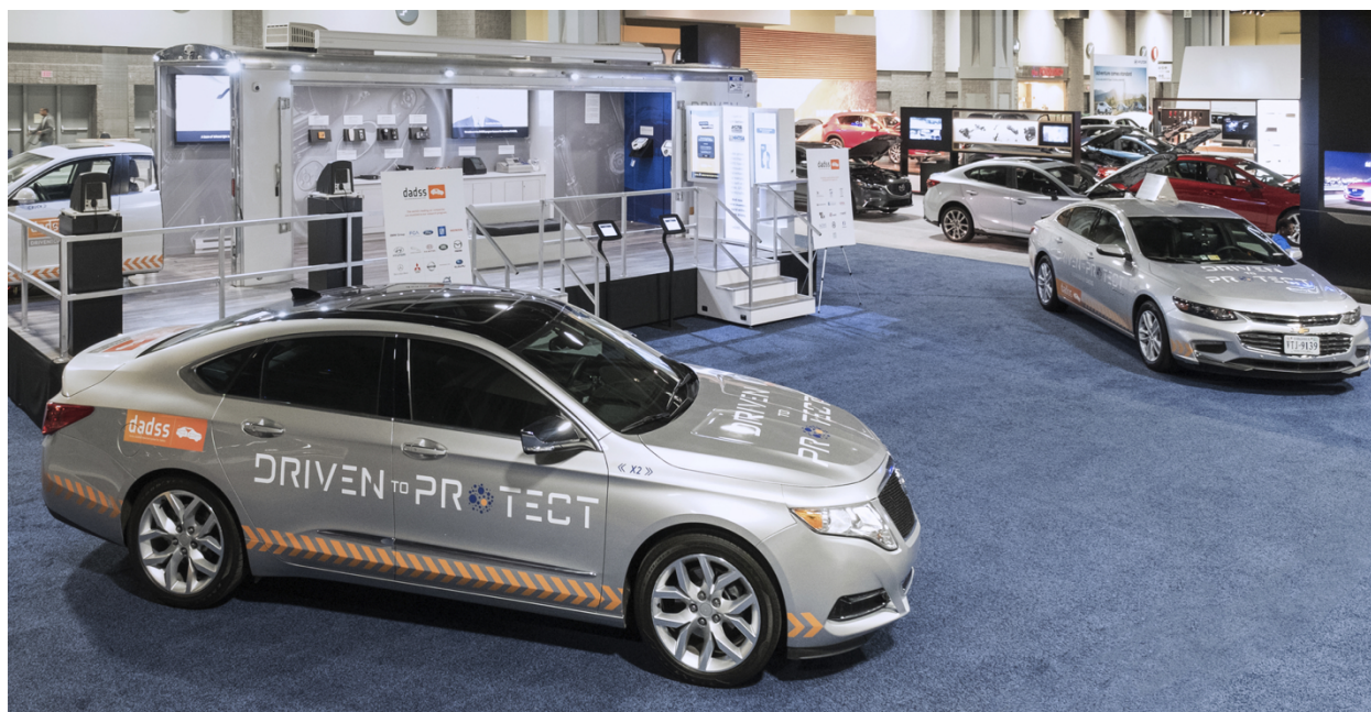
Figure 8 Driven to Protect exhibit at the Washington Auto Show (2018).