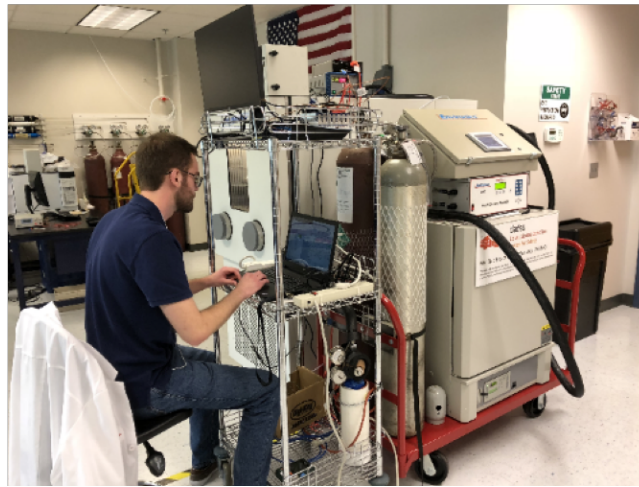
Figure 4 Component level testing in an environmental chamber at the DADSS Lab in Marlborough, MA

Following good scientific and engineering practice, testing of the DADSS technologies, i.e., at the component level at the DADSS Lab, at the system level involving human subjects at Harvard's McLean Hospital, and at the vehicle level through on-road evaluations (currently in Virginia and Massachusetts) is currently being conducted over a broad range of BAC from 0.00% through 0.12%, over a broad range of operational and environmental conditions and alcohol consumption and elimination protocols.