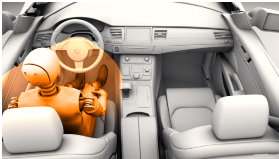
Figure 3 Breath-based DADSS System Illustration

The breath-based system measures alcohol as a driver breathes normally, when in the driver's seat. It is being designed to take instantaneous readings to accurately and reliably distinguish between the driver's breath and that of any passengers.