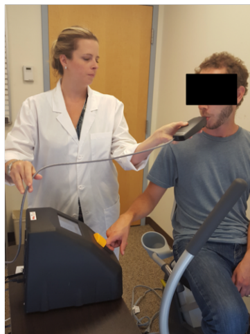
Figure 5 System level testing involving human subjects at McLean Hospital, a Harvard Medical School affiliate