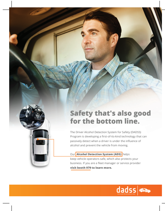
Figure 7 NAFA Institute & Expo Program Ad (See https://www.nafainstitute.org/Home.aspx ).