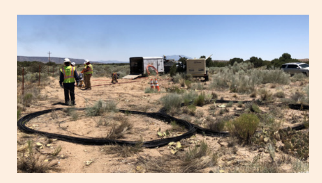
Fiber crews coil the fiber optic cable in large figure eights in preparation to blow the fiber between pull boxes located approximately 2000' feet apart. The process is repeated every 1-2 pull boxes for the 30-mile route.

Because the Middle Rio Grande Pueblo Tribal Consortium was unable to resolve the rights-of-way issues working directly with the BIA, the consortium retained legal counsel to interpret the new regulations and