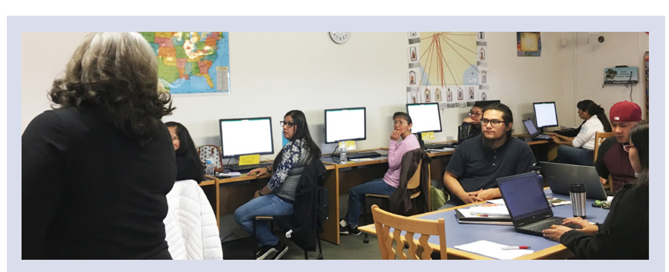
Santo Domingo Tribal Library patrons benefit from a host of new technology-rich trainings on basic computer skills, on-line bill payments, to entrepreneurial artist webpages. Additionally, the library has since started coding classes for youth.

Similar to the networks featured in this case study, the Navajo Nation Tribal Consortium leading one phase of this multi-year effort to bring 380 mile of new fiber to the Navajo Nation, used a consortium approach and the same network design model that also interconnects the new high-speed networks at the Albuquerque GigaPop. By connecting to the tribally-owned equipment that is physically located in the Albuquerque GigaPop suite, it creates a private network for the tribal schools and libraries in New Mexico and allows for the delivery of network services. The tribal library in Torreon, established in 2017 with the assistance of the New Mexico State Library, will have a 100MB fiber connection by the end of 2020.