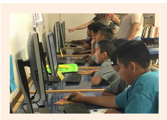
Pueblo youth use the library computers to access the internet.