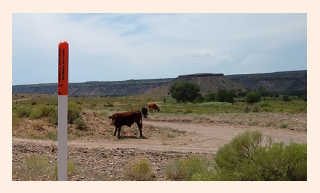
Middle Rio Grande Pueblo fiber marker near San Felipe Pueblo connecting to Santo Domingo Pueblo follow pre-disturbed back roads to minimize the environmental impact of the fiber route.

While E-rate modernization offers greater flexibility in choosing how to acquire fiber connectivity, the implementation of special construction projects, especially on tribal lands, is not without challenges. The following examples from the two networks were not the only challenges encountered but are representative of common obstacles when deploying advanced telecommunications