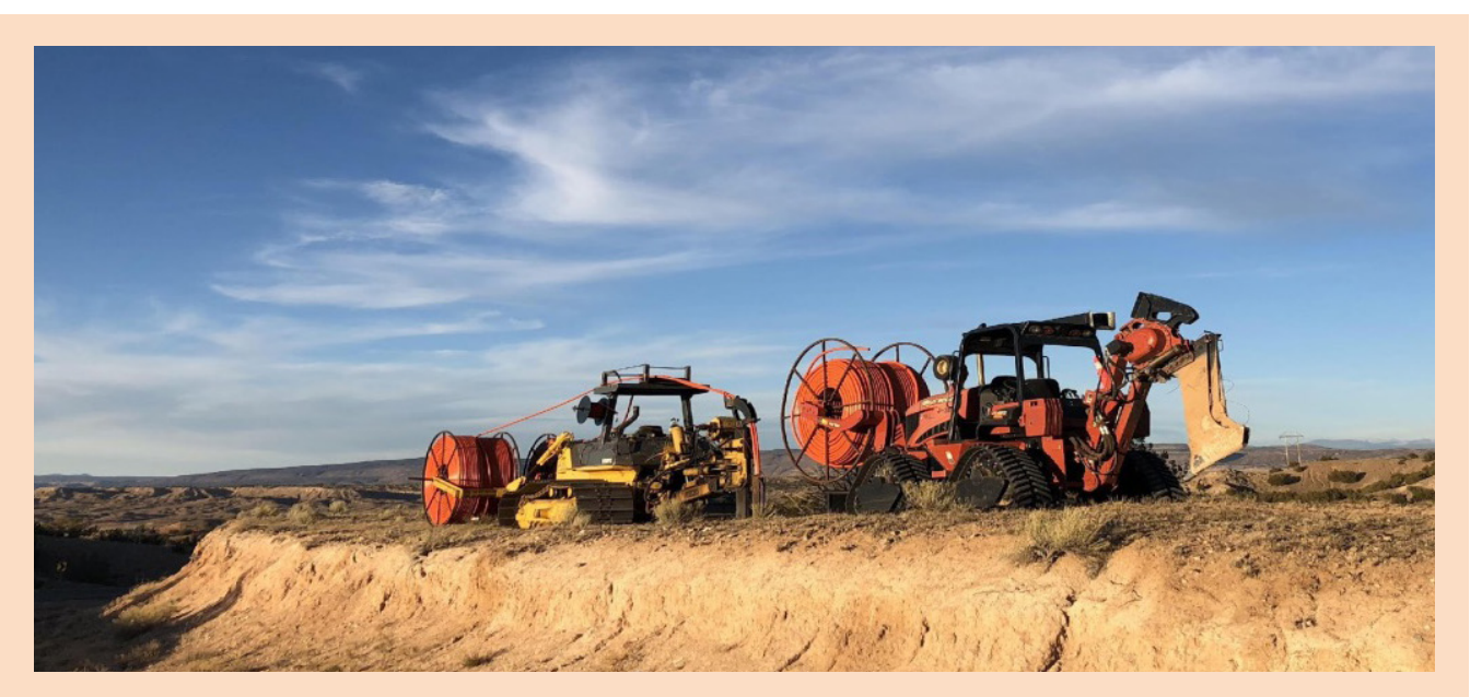
Ploughs are able to 'sew' the conduit into the ground by cutting a 6" opening to lay the conduit at depth without the labor costs and invasiveness of a backhoe to complete the same job.

Drawing on the challenges and lessons learned from the network projects, three sets of recommendations are offered to enhance support for tribal libraries and their participation in the E-rate program. These recommendations cut across state and federal agencies and focus on three areas: promoting awareness of E-rate opportunities and processes; advocacy for the eligibility and inclusion of tribal libraries in E-rate opportunities and initiatives; and technical support