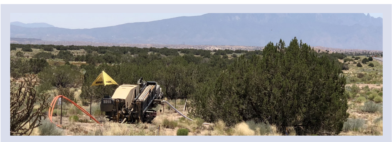
Kelly Cable of NM Directional drilling equipment utilizes trenchless technology on the Jemez-Zia project to install the conduit for the fiber optic cable across rugged terrain, such as arroyos, or under roads.

throughout E-rate application and implementation