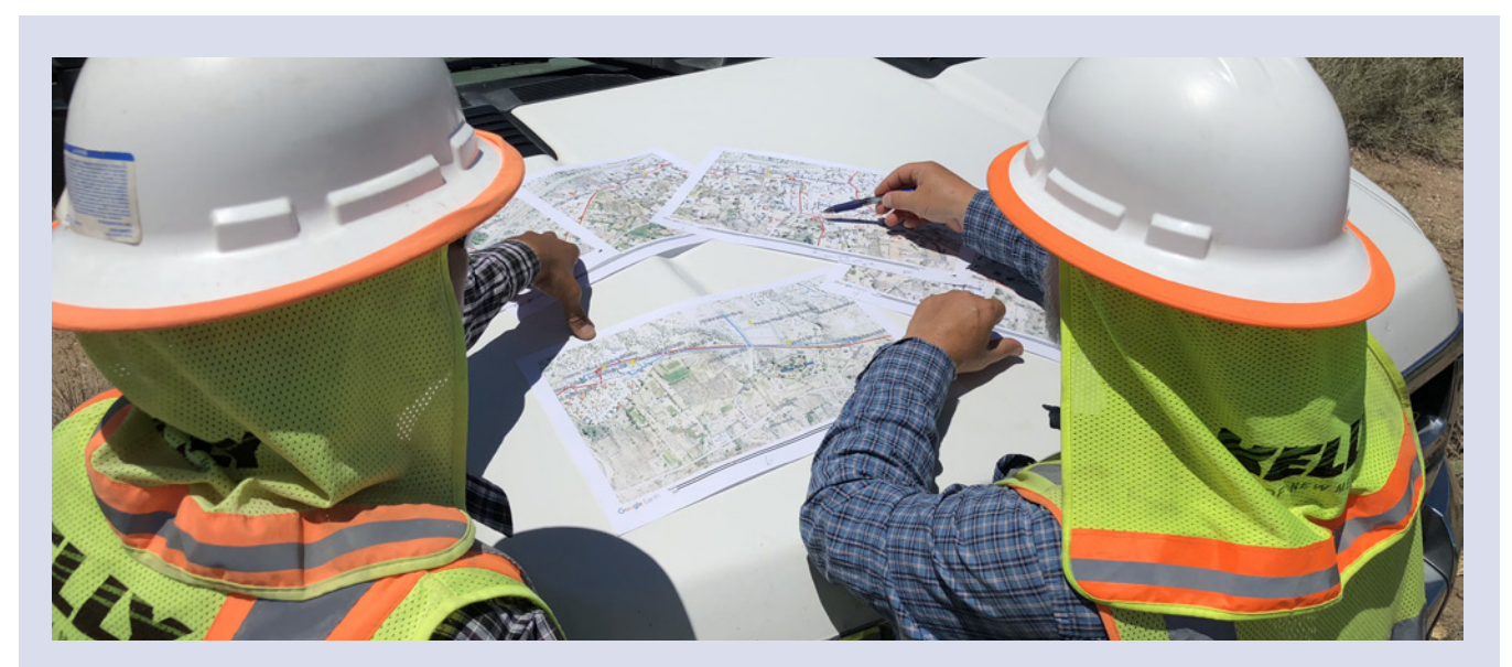
Kelly Cable of NM crew reviews route maps to complete the final 12-mile stretch along NM State Highway 550.

With 60 days remaining before the E-rate filing deadline, the consortium had to reach out to two independent tribal governments. They decided to approach the Pueblo of Santa Ana first. Geographically, this pueblo was the closest to Albuquerque, and Santa Ana also had an established IT department, staffed with four IT professionals—more than any other pueblo in the consortia. Santa Ana already had fiber and wireless connectivity in their community, and they understood the benefit of bringing in additional fiber connectivity. With the technical assistance of the IT department, Santa Ana's tribal leaders agreed to join the consortium and eventually agreed to serve as the fiscal agent. The fiscal agent can act on behalf of the other entities in the application, and also assumes the financial and legal responsibility for all