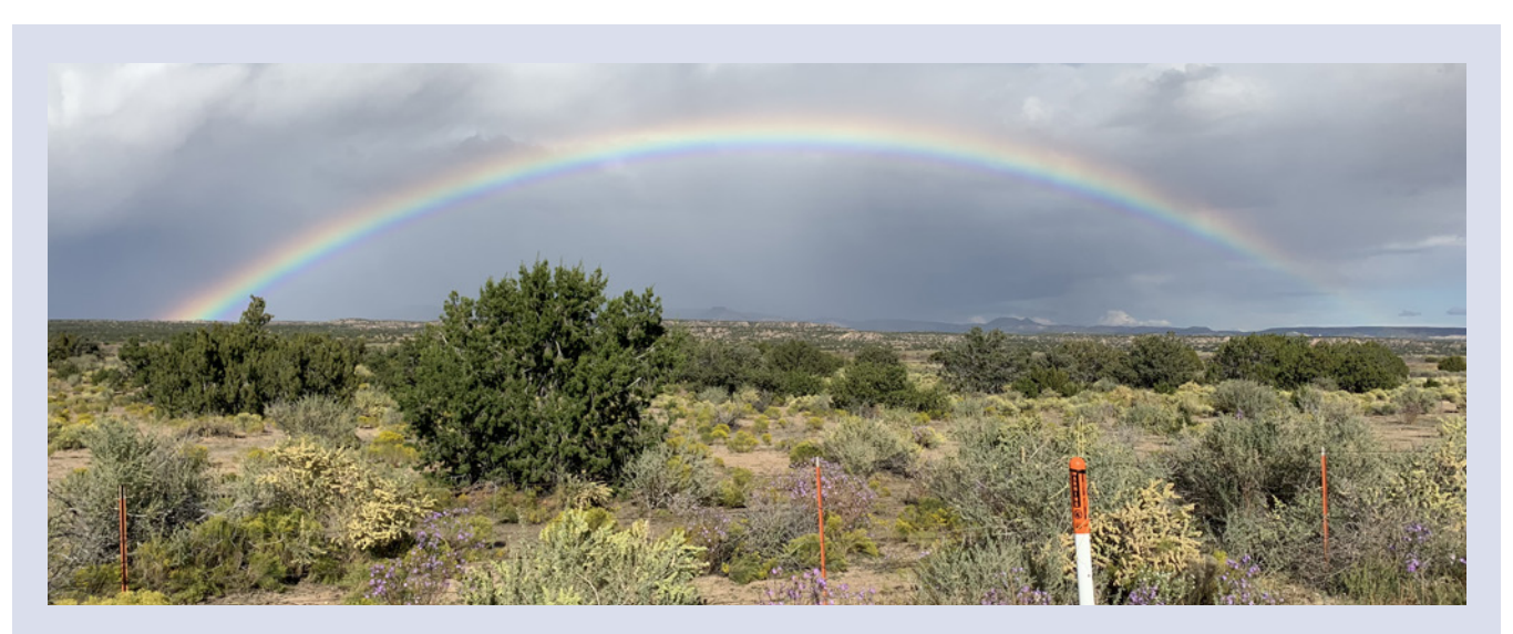
A rainbow over the Jemez-Zia fiber optic route at the edge of Jemez lands after the network was completed and the fiber had begun transmitting data to Jemez Pueblo.