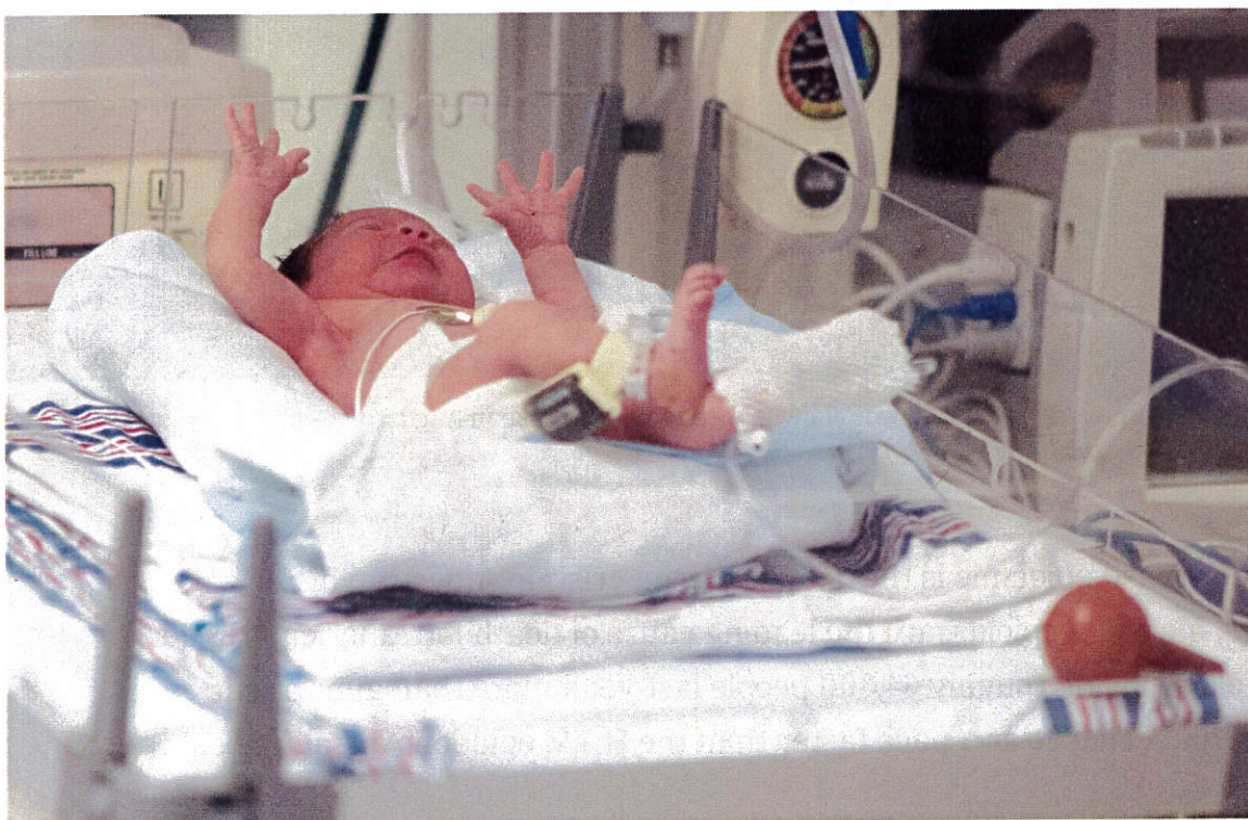
Even babies are affected by the crisis, with a surge of newborns dependent on opioids.

A team of reporters went inside the epidemic, from New England to “safe injection” areas in the Pacific Northwest, to explore the experiences of addicts and those trying to stem the tide. “I don’t know how I’m alive, honestly,” one Massachusetts woman said. Here are their stories ( https://www.nytimes.com/2017/01/06/us/opioid-crisis-epidemic.html ).