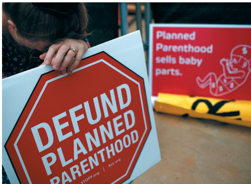
The collection of aborted fetal tissue for use in research has prompted demonstrations for and against US health provider Planned Parenthood.

number of eye diseases, including age-related macular degeneration, the most common cause of blindness in adults in the developed world. The 2000s saw advances in ways to create cell cultures with RPE dissected from the eyes of fetuses, allowing scientists to study the function of these cells in a dish. And although some scientists have turned to stem cells to generate RPE, like Goldstein they continue to use fetal tissue as a benchmark of normal development and function.