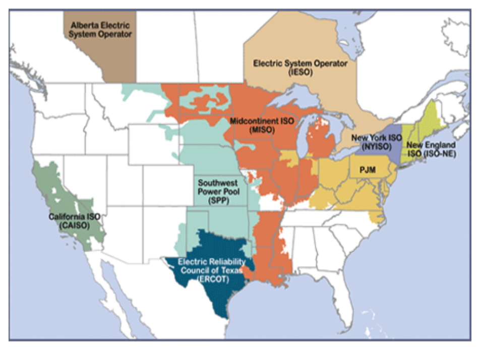
Fig. 1: RTOs/ISOs