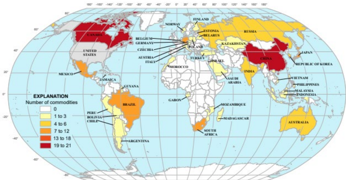
Figure 3.—Leading Import Sources* (2020–23) of Nonfuel Mineral Commodities for Which the United States Was Greater Than 50% Net Import Reliant

Through China's long-term global mineral strategy, they have become a leading supplier of processed critical minerals. Moreover, according to USGS, production concentration has increased markedly over the past few decades for many mineral commodities with the most notable global shift being the increasing production of mineral commodities in China. 5