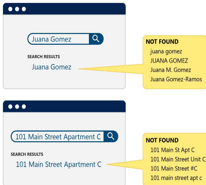
Exhibit 4. Visual representation of a name and address search in the UC Portal

Staff reported finding cases in which many children were released to the same address. Because the UC Portal lacked the ability to link nearly-identical records and includes all historic sponsorship records for attempted and actual sponsors, search results were not always reliable for use in quickly identifying potentially unsafe sponsors. As one case manager stated, "The system doesn't trigger a notification that one person may be sponsoring 15 kids at the same apartment complex, or in the same unit."