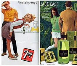
These 1960's Ads Cross Every Line Kale and Cardio