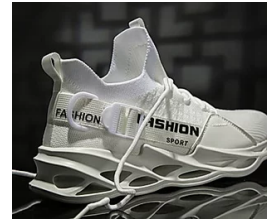
The Best Shoes for Walking and Standing All Day todaysdeals-v.com