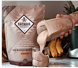
11 Benefits of Drinking Ka'Chava Daily Ka'Chava