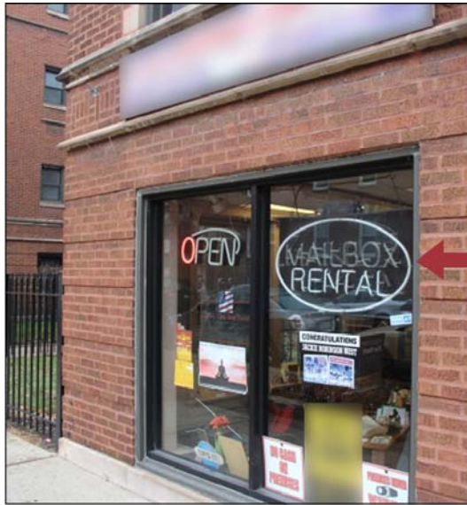
Figure 2: Mailbox Rental Store with a Suite Number Address Used as a Provider Practice Location

Provider listed this mailbox-rental store as its practice location