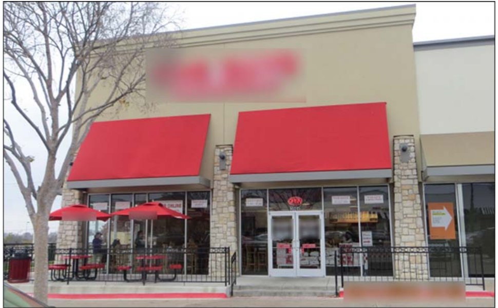
Figure 3: Fast-Food Franchise Listed as Provider's Practice Location