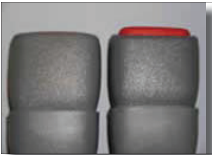
A comparison of the Gen 2 and Gen 3 seat belt buttons. The Gen 3 had a button that protruded from the cover.

Court cases highlighting the dangers of cars with inferior or no seat belts spurred major safety improvements, with both seat belts and seat backs redesigned in response to litigation.