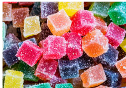
District of Columbia Seniors Rush To Try Powerful New Cannabis Discovery (Best Pain Relief)