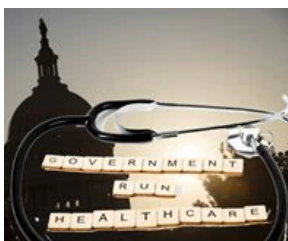
Dems' Budget Plan Hides a Slow-Moving Healthcare Takeover