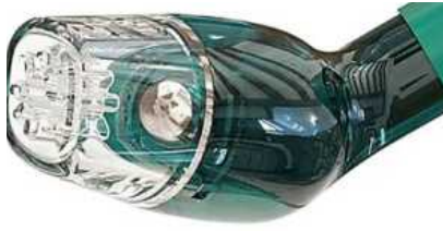
This All-Natural Lung Cleaning Device Helps Anyone Breathe Easier