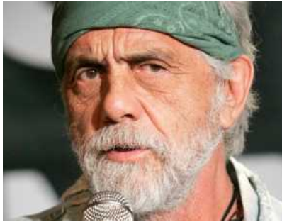
The Horrifying Truth About CBD