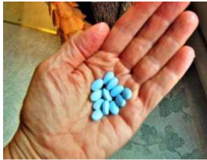
ED Doctors to Men: You Don't Need Viagra: Try This Before Bed Tonight!