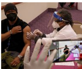
Under Dems' Drug Pricing Plan, Dozens of New Meds Will Never Be Invented