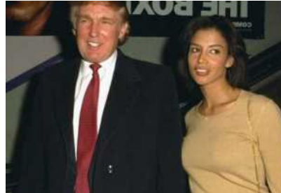
The 30 Biggest Stars Backing Trump's Campaign