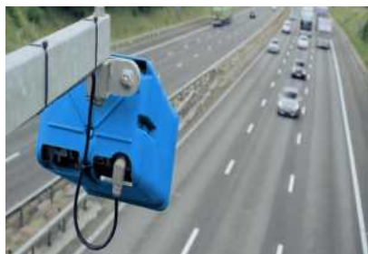
Big Change In DC Leaves Drivers Fuming