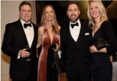
The Most Successful Injury Attorneys in Washington. See the Lists