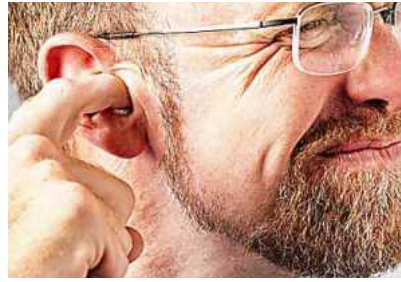
Brain Surgeon: Do This to Relieve Tinnitus and Hearing Loss (It's Genius!)