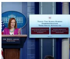
Hold the Applause, Biden Shouldn't Take an Obamacare Victory Lap