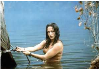
Accidental Bloopers That Became Iconic Movie Moments