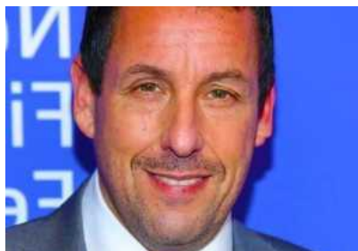
30 Stars Who Are Supporting Trump Till the End