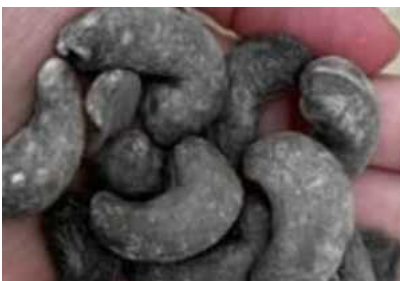
Anyone with Diabetes Should Watch This (What They Don't Tell You)