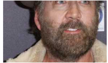
Nicolas Cage's Private Island Cost Him $7m, and This is What It Looks Like