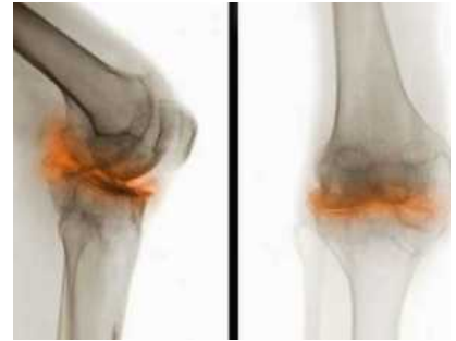
Bone on Bone? Take This Once a Day for New Knees, Says Top Doc