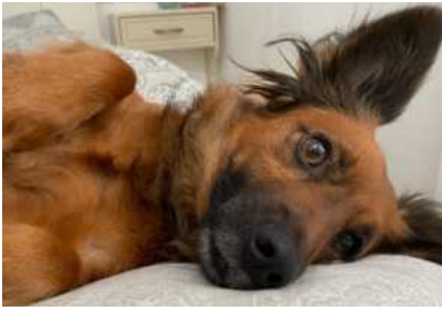
How Dogs Cry For Help: 3 Warning Signs Your Dog Is Crying For Help