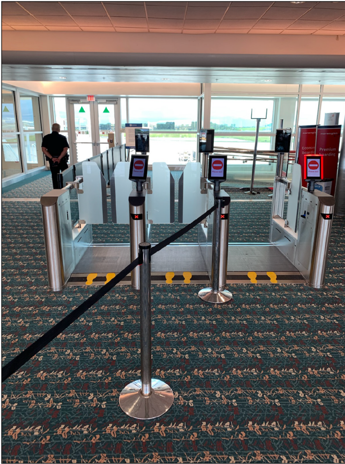
Figure 1: Examples of Cameras Used for Air Exit Facial Recognition