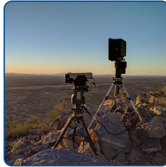
Agent Portable Surveillance System (APSS)

The system consists of ground sensors and cameras to detect, track, identify, and differentiate humans, animals, and vehicles. Communications equipment links information captured by the system to a command and control center and can link directly to border patrol agents.