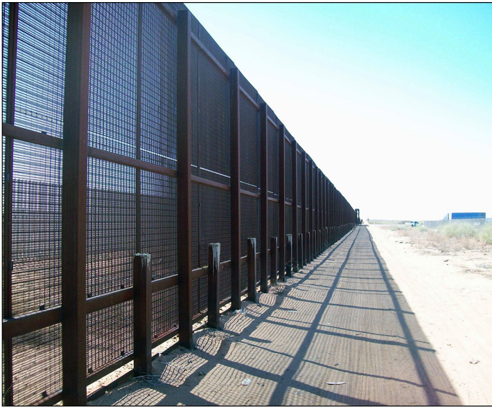
Double steel mesh style pedestrian fence