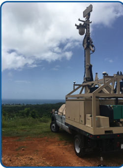
Mobile Surveillance Capability (MSC)

The system consists of a portable, handheld infrared camera and corresponding remote viewing kit that enables Border Patrol agents to see clearly up to 5 miles in areas that are dimly lit or in total darkness. The system does not link to a command and control center.