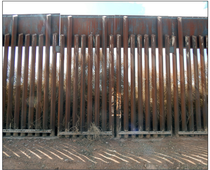
Bollard style pedestrian fence