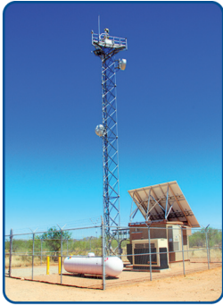
Integrated Fixed Towers (IFT)

The system consists of radar and daylight and infrared cameras mounted on 80- to 160-foot-tall fixed towers. Power generation and communications equipment are linked to a command and control center.