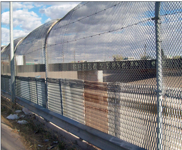
Expanded metal style pedestrian fence