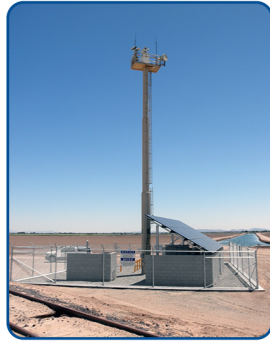
Remote Video Surveillance System (RVSS)

The system consists of radar, daylight and infrared cameras, a laser range finder, and a laser illuminator mounted 25 feet high on a truck. Power generation and communications equipment link the information captured by the system to the control station located within the cab of the truck, not to a command and control center; the information is displayed on multiple monitors for the operator to view.