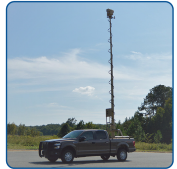
Mobile Video Surveillance System (MVSS)

The system consists of multiple daylight and infrared cameras and a laser illuminator mounted on an 80-foot-tall tower, which is on a steel platform trailer and can be relocated to other sites. The system links to a modular command and control center.