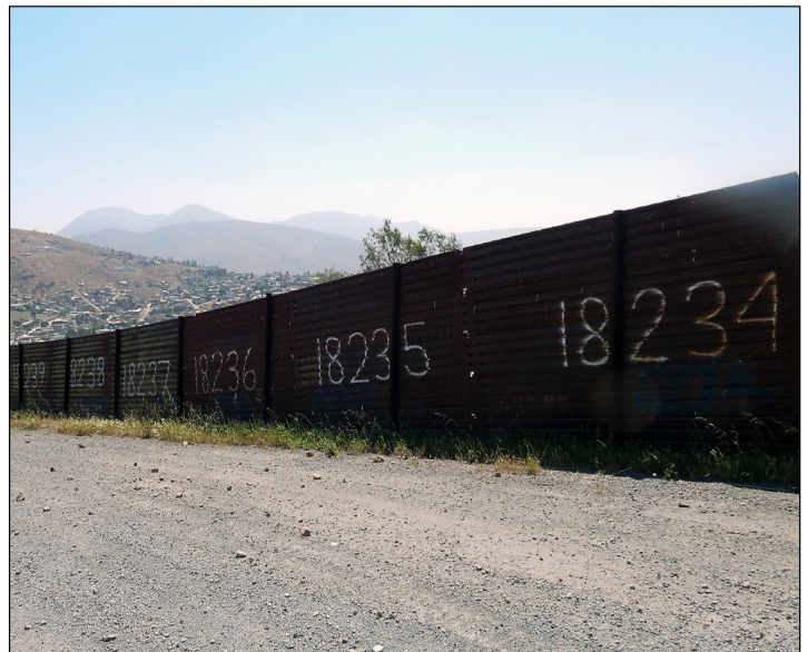
Landing mat style pedestrian fence