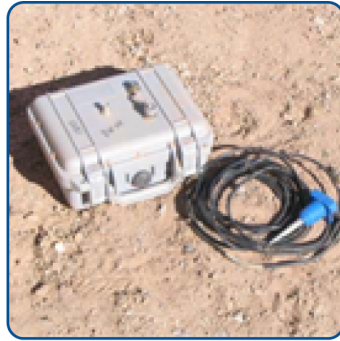
Unattended Ground Sensors and Imaging Sensors (UGS and I-UGS)

The system consists of radar and daylight and infrared cameras mounted on 80- to 160-foot-tall fixed towers. Power generation and communications equipment are linked to a command and control center.