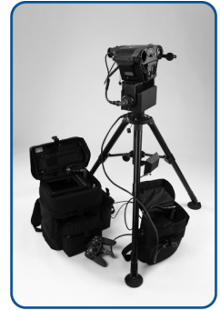
Thermal Imaging Device (TID)

The system consists of radar, daylight and infrared cameras, and a laser illuminator. It is portable and is intended for use in areas where Border Patrol cannot deploy truck-mounted mobile systems. The system does not link to a command and control center.