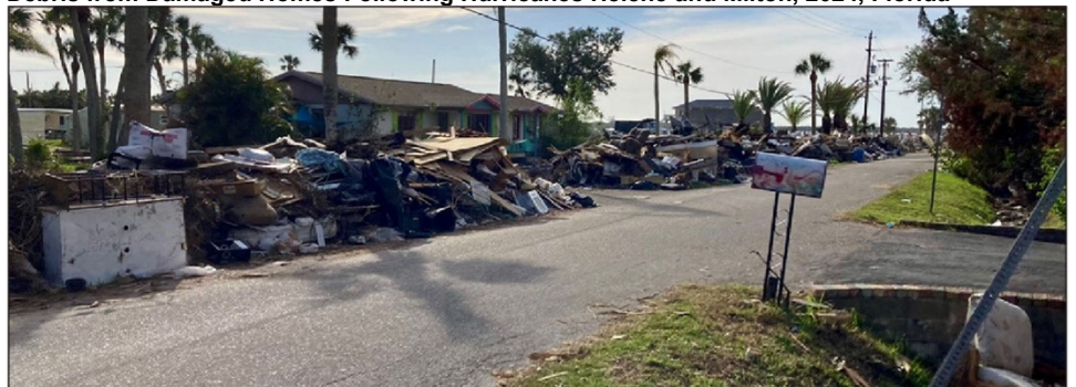
Debris from Damaged Homes Following Hurricanes Helene and Milton, 2024, Florida