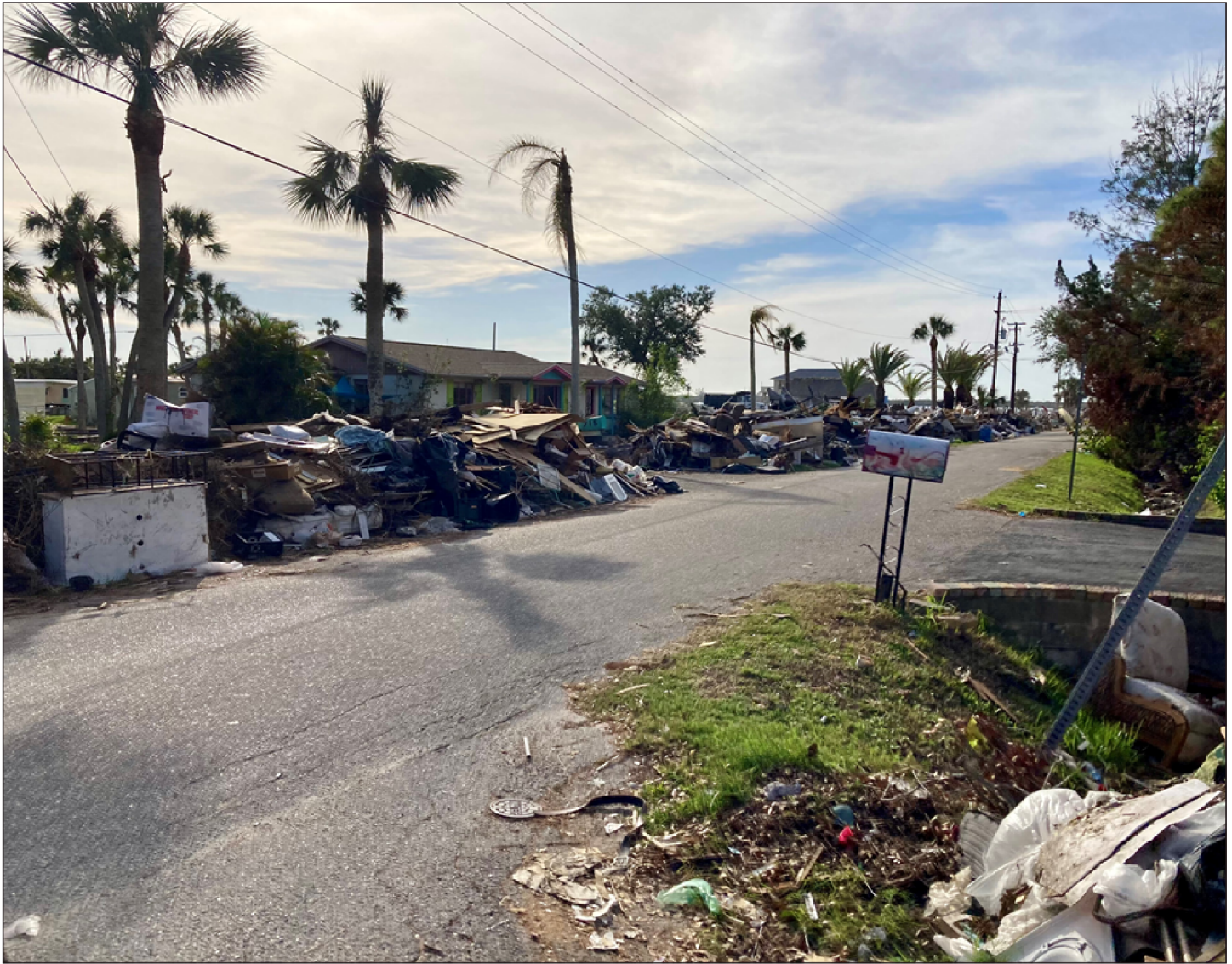
Figure 1: Debris from Damaged Homes Following Hurricanes Helene and Milton, 2024, Florida