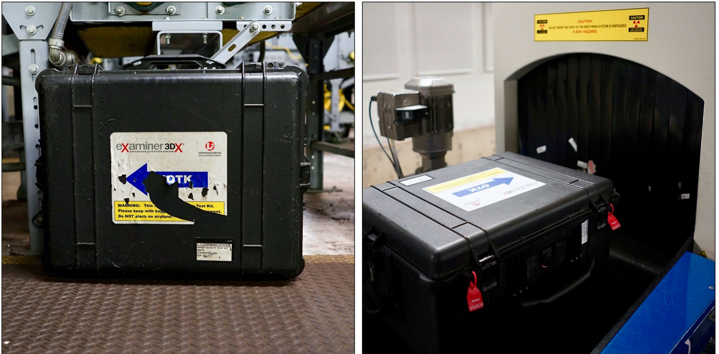
Figure 2: Images of Calibration Procedures and Operational Test Kits Used for Explosives Detection System Technology