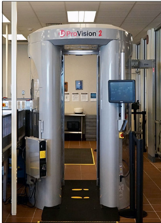
Figure 3: Advanced Imaging Technology Machine

As discussed earlier in this statement, TSA may use advanced imaging technology as part of its primary passenger screening at airport security checkpoints (see figure 3). Passengers who trigger an alarm on the advanced imaging technology machine may be required to undergo secondary screening, which could include a targeted pat-down and, in some cases, explosive trace detection screening.