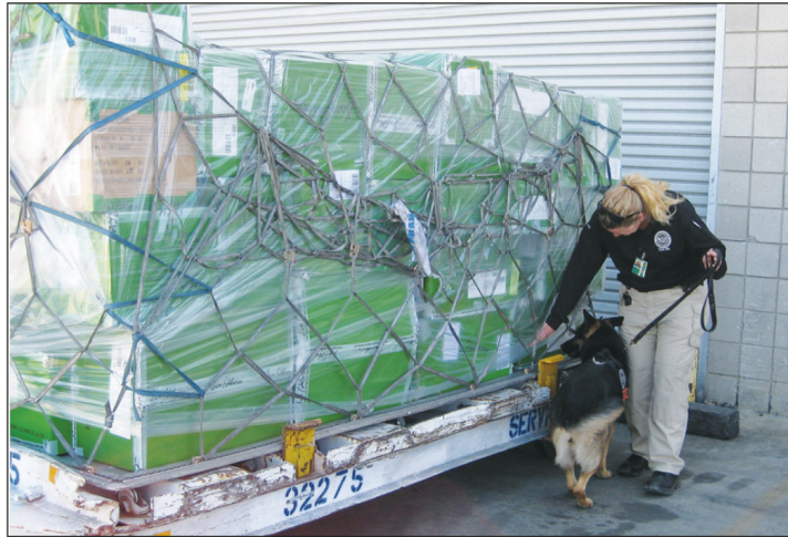
Transportation security inspector team screening air cargo