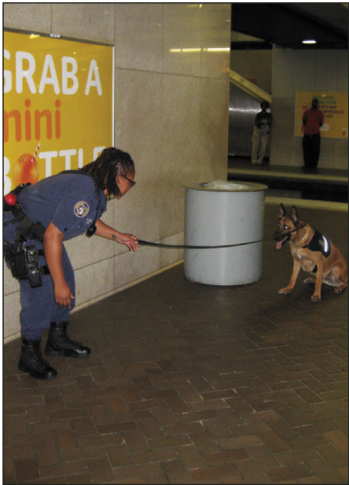
Law enforcement officer team patrolling mass transit terminal