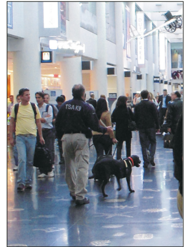
Passenger screening canine team searching airport terminal