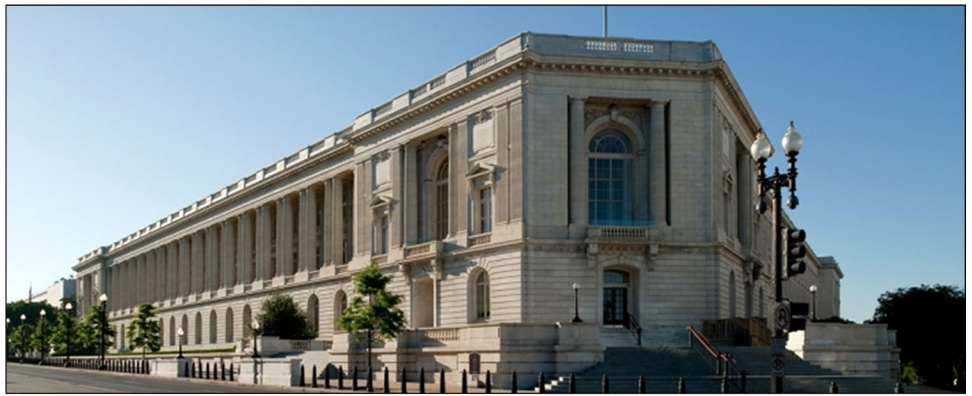
Figure 1: Cannon House Office Building, Washington, D. C.

GAO-21-105363