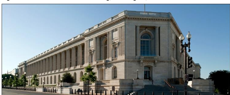
Figure 1: Cannon House Office Building, Washington, D. C.

accommodate large meetings. The building also includes a library, food servery, and a health unit.