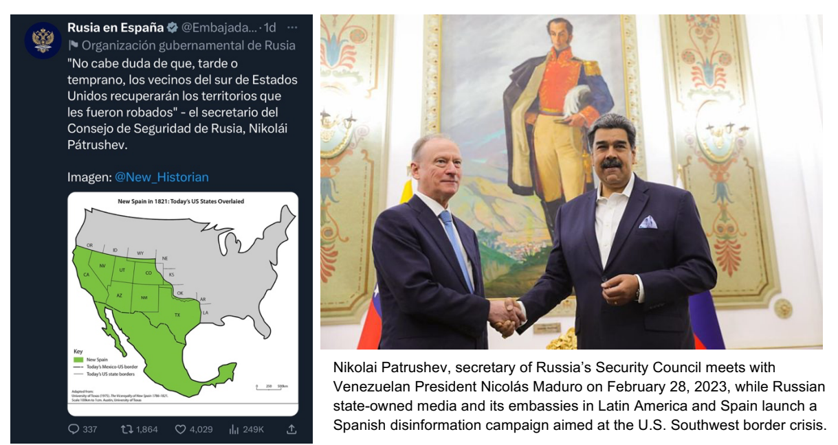
FIGURE 1: Russian Disinformation Campaign Drawing a New U.S. Southern Border, 2023

Russia is not alone in this effort. China, Iran, Cuba, and Venezuela are all finding ways to capitalize on the U.S. border and immigration crisis, by partnering with or utilizing Transnational Criminal Organizations (TCO) to destabilize American communities and steal U.S. sovereignty. This is not exclusive to the United States. The same state and non-state alliance is acting against several other nation-states in the Western Hemisphere to increasingly blur the lines of sovereign borders and establish bi-national zones of "peace" to provide impunity to criminal organizations.