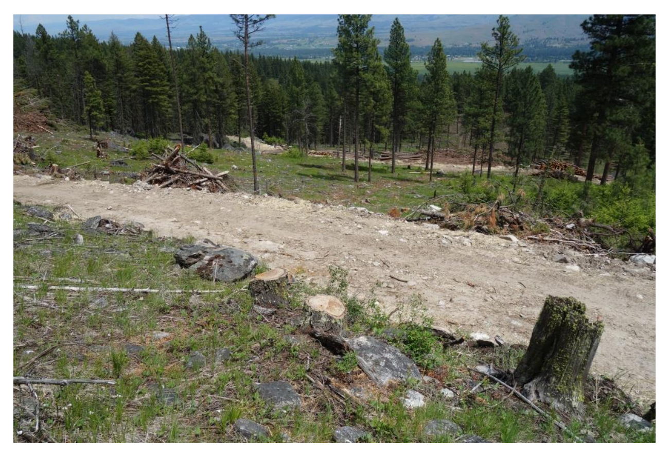
Above photo shows "thinning" and road building on the Westside project, Bitterroot National Forest. This had been a roadless area covered by a shady mature Douglas fir forest.

Above are before and after pictures of old growth ponderosa pine-Douglas fir forest logged by Bitterroot National Forest on the Westside project, done under the guise of forest health. Photos taken from the same point—large Doug Fir on right side is stump in the after picture (tree was 190 years old). Large ponderosa pine barely visible left of my head was cut--age 242 years. BNF denied this area was old growth, but after it was cut, I measured stumps and counted rings. They were wrong, but they had to get the cut out. This area will take several human lifetimes to recover (if ever with a changing climate).