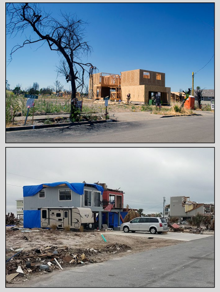
FEMA's Individuals and Households Program provides individuals with financial assistance, such as grants to help repair or replace damaged homes, and temporary direct housing assistance, such as recreational vehicles.

I GAO-19-617T