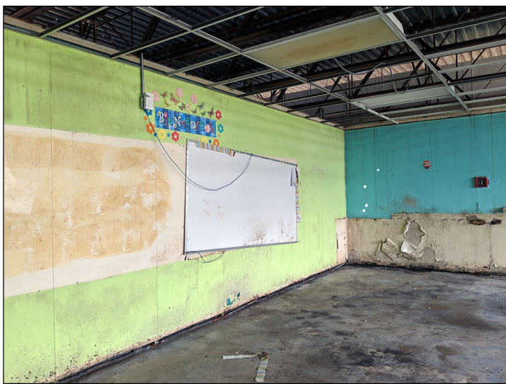
Classroom with molded floors and water damage on the walls at the Berwind Intermediate School in San Juan, Puerto Rico.

I GAO-19-617T