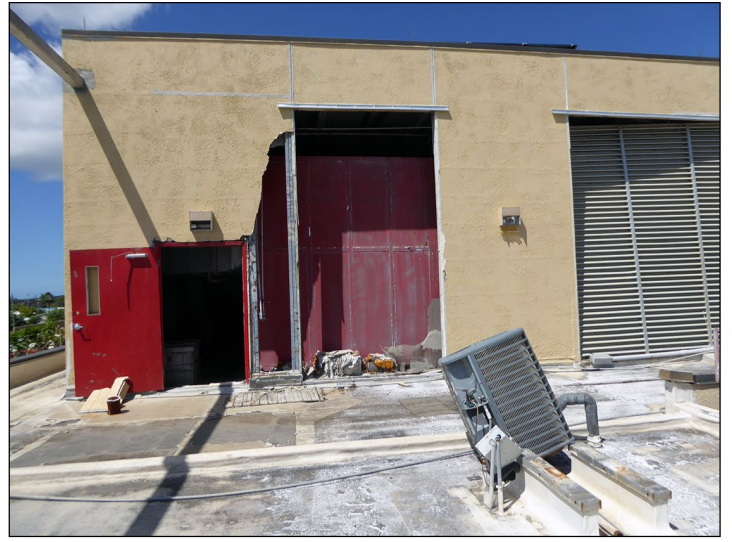
Damaged structure and ventilation system of the Governor Juan F. Luis Hospital and Medical Center in St. Croix, U.S. Virgin Islands.