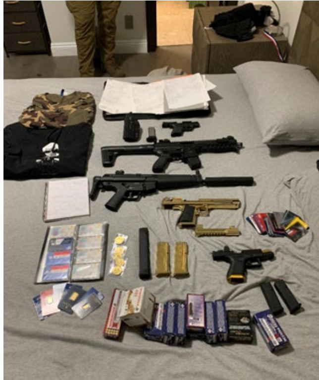
During the execution of a UI fraud search warrant, OIG agents recovered multiple firearms, UI debit cards, and notebooks containing personally identifiable information.

As of January 2023, our pandemic investigations have resulted in upwards of 700 search warrants executed and over 1,200 individuals charged with crimes related to UI fraud. These charges resulted in more than: 500 convictions; 11,000 months of incarceration; and $905 million in investigative monetary results. We have also referred over 23,000 fraud matters that do not meet federal prosecution guidelines back to the states for further action.