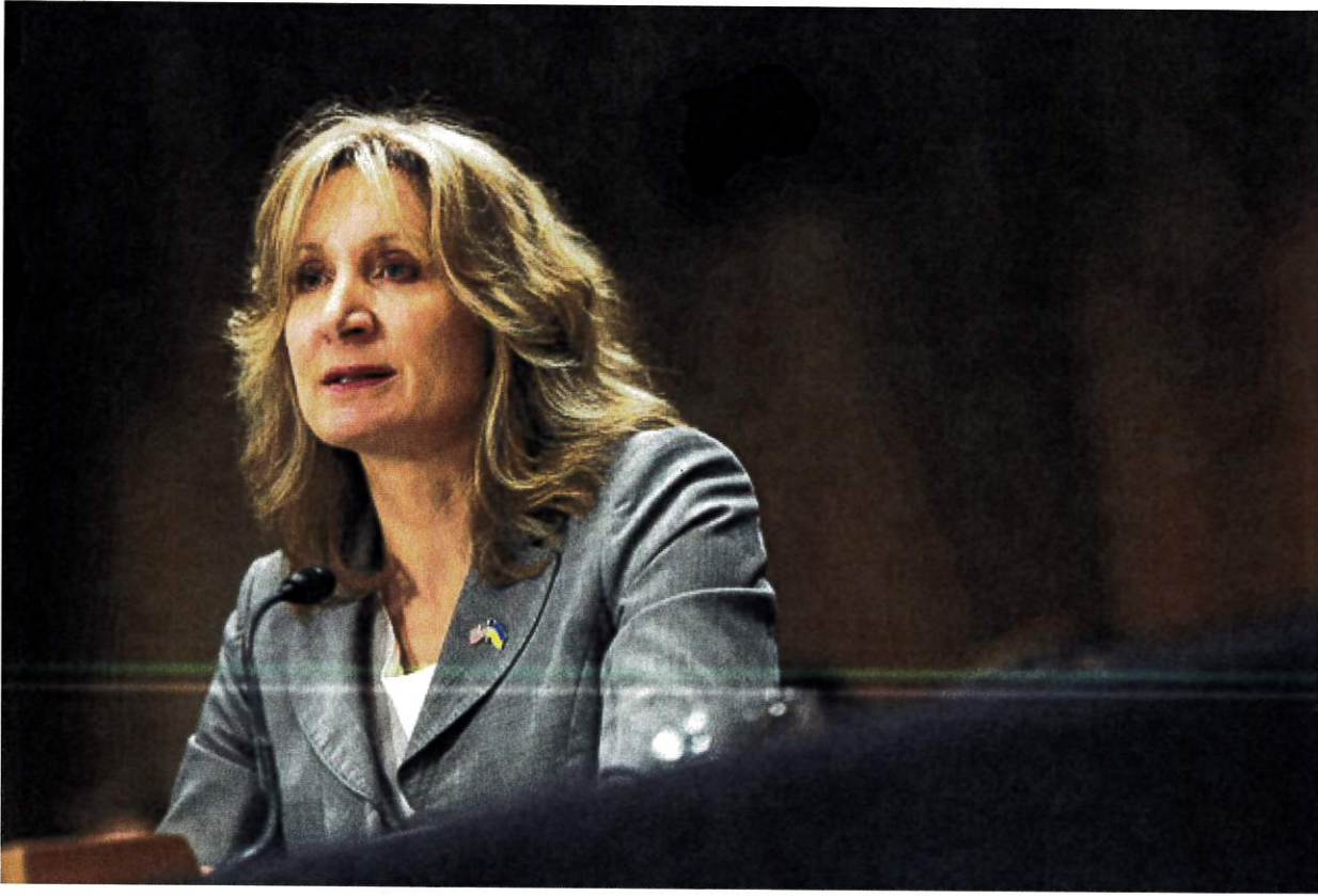
📷 Beth Van Schaack testifies before the Senate foreign relations committee on Capitol Hill on 31 May 2023.

“The reality is that perpetrators will go free” and “international crimes will continue”, said Beth Van Schaack, ambassador-at-large for global criminal justice during the Biden administration. “It will take years to rebuild the expertise in our law enforcement and diplomatic corps.”