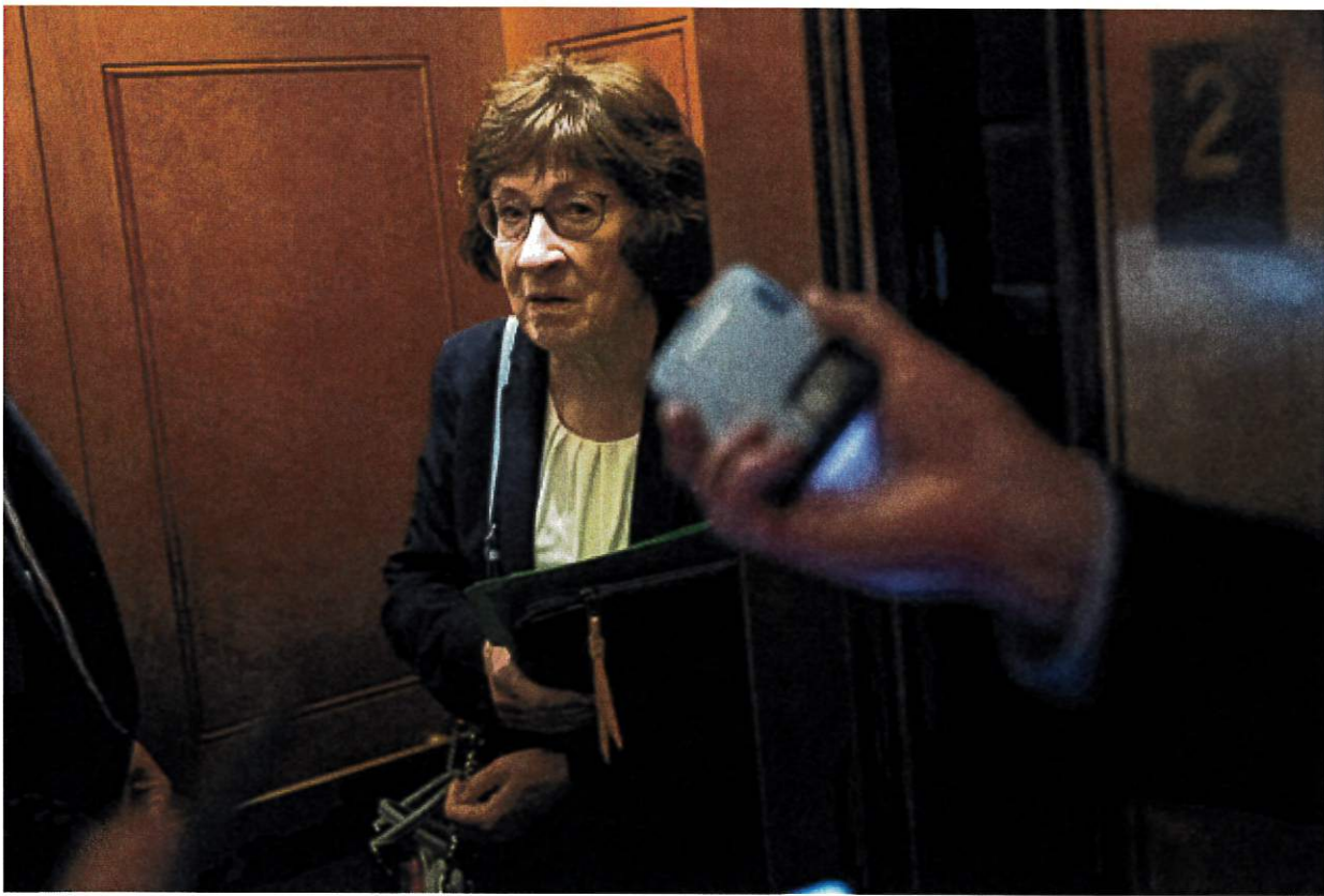
📷 Senator Susan Collins at the Capitol on 4 September 2025.

In its response to a query from the Guardian, the justice department said money appropriated by Congress would be spent, but that organizations that received money in the past wouldn't necessarily do so in the future - as appropriations would be made in accordance with Trump administration priorities.