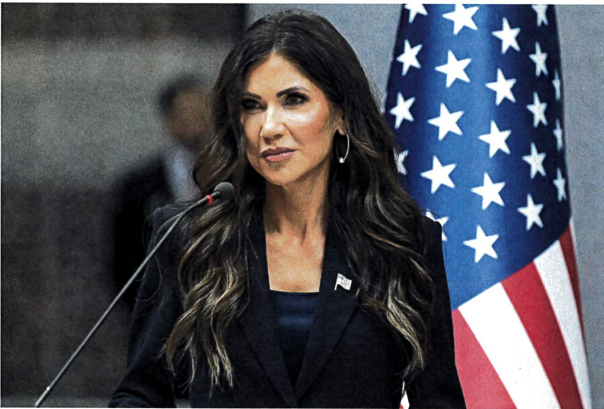
📷 Homeland security secretary Kristi Noem.

Advocates of varying political views praised many aspects of the first Trump administration's work on these issues from 2017 to 2021. But things have changed as Trump and his appointees have shifted course after his re-election - and as many progressives and conservatives have blasted his administration for refusing to release the full investigative files related to the late Jeffrey Epstein, currently the world's most infamous sex trafficker.