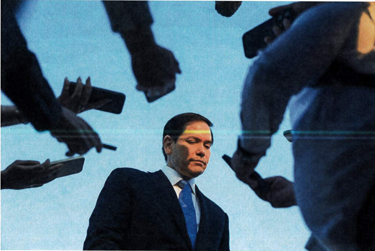
📷 Secretary of State Marco Rubio speaks to media at Ben Gurion international airport in Israel on Tuesday.

In the 14 years it has been produced, the release of the Tip report has never been delayed beyond July.