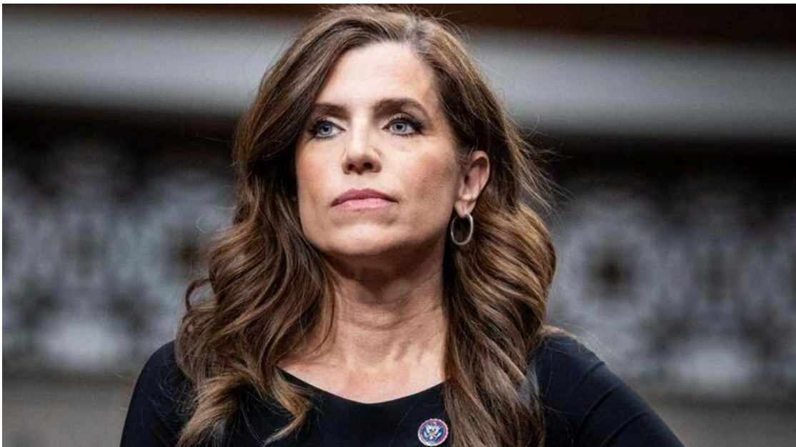
U.S. Representative Nancy Mace (R-SC) is shown at the U.S. Capitol in June 2024.

Updated July 16, 2024 1:23 PM Gift Article