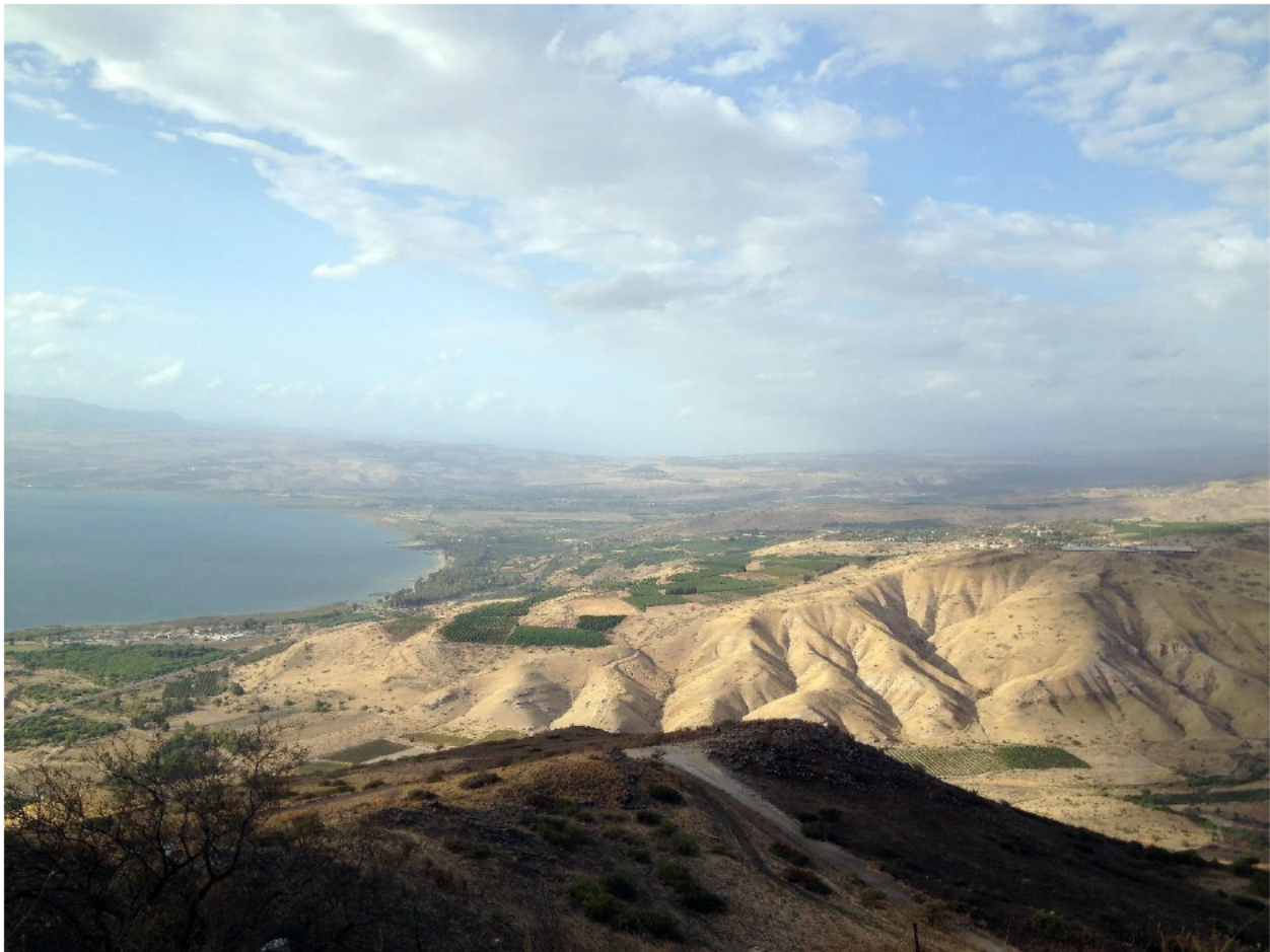
Photo: The Golan Heights plateau, overlooking the Sea of Galilee to its southwest.

President, Jerusalem Center for Public Affairs; Former Director-General of Israel’s Ministry of Foreign Affairs and Ambassador of Israel to the United Nations