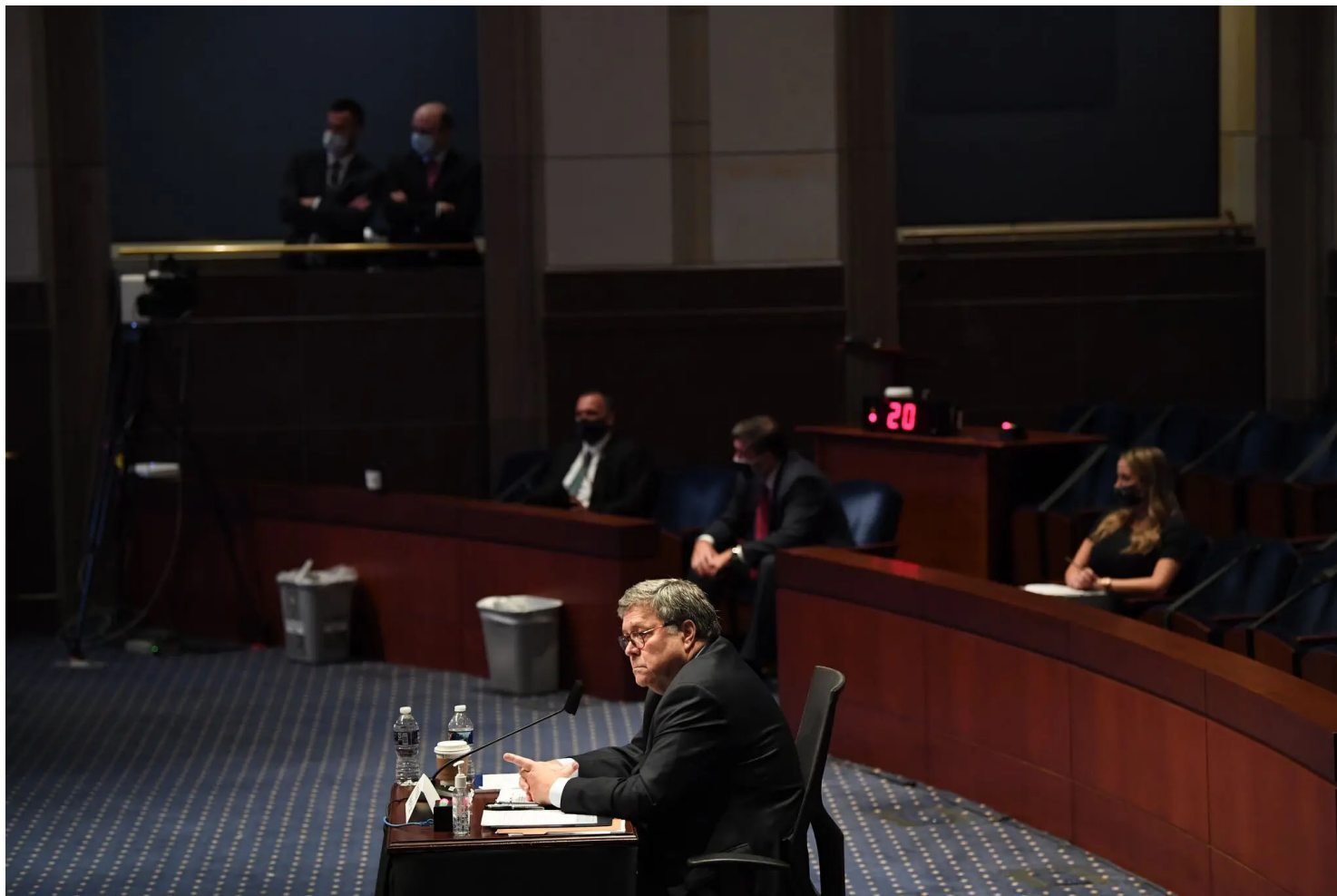
As attorney general, William P. Barr played up the threat from antifa, a loose collection of leftist agitators, even as Justice Department and F.B.I. officials saw a greater threat from the far right.