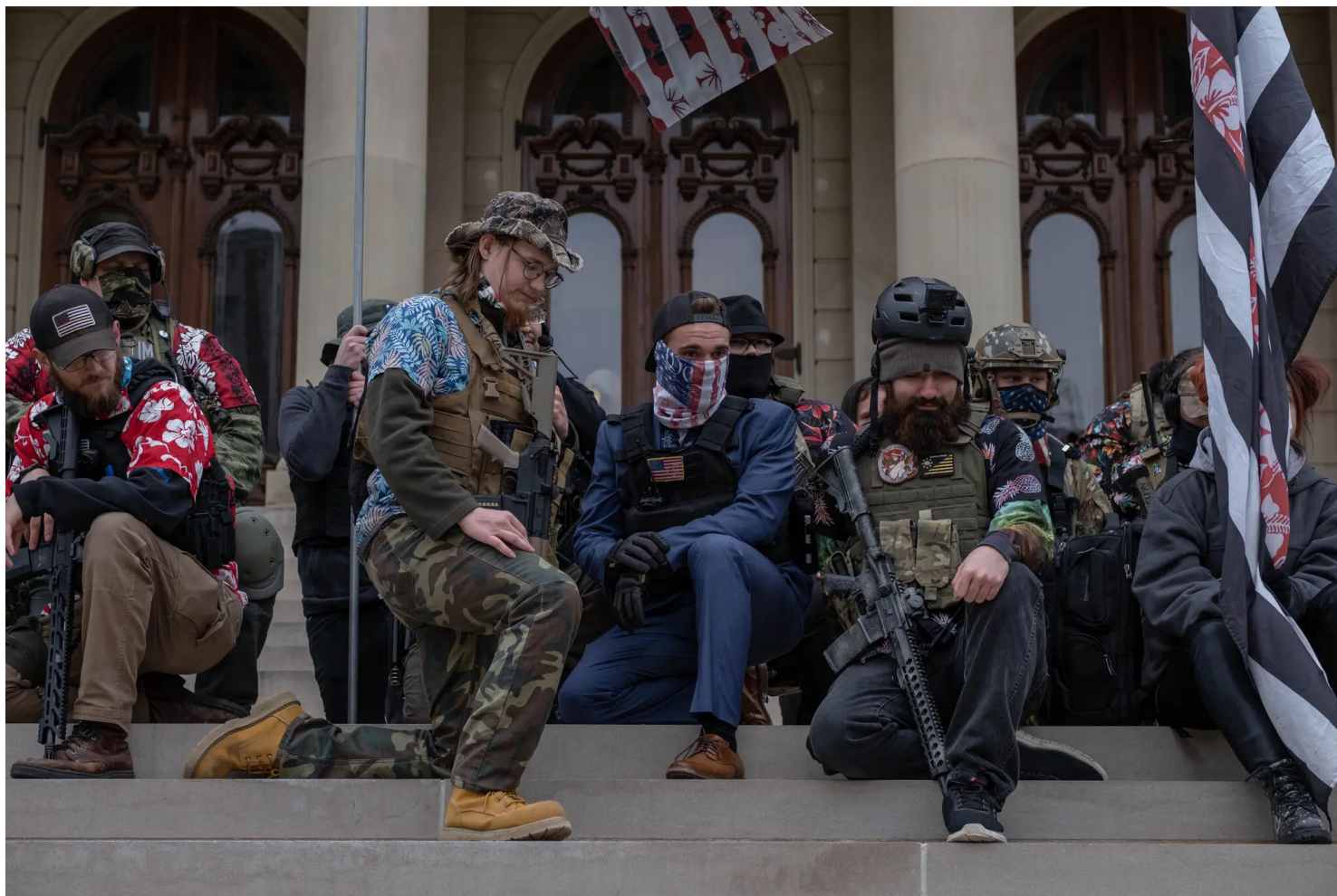
A group affiliated with the boogaloo, a loosely organized far-right movement preparing for a civil war, in Lansing, Mich., in October.

Over the late spring and summer, the F.B.I. opened more than 400 domestic terrorism investigations, including about 40 cases into possible antifa adherents and 40 into the boogaloo, a right-wing movement seeking to start a civil war, along with investigations into white supremacists suspected of menacing protesters, according to F.B.I. data and a former Justice Department official. Even among those movements, career prosecutors saw the boogaloo as the gravest threat.