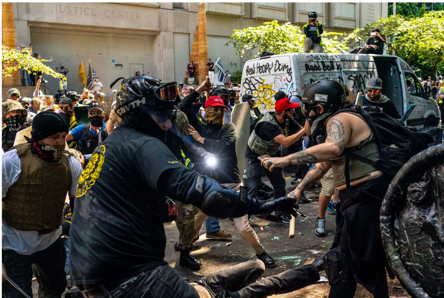
Far-right and far-left groups clashing in Portland, Ore., in August. Dozens of F.B.I. employees and senior managers were sent on temporary assignments there, according to current and former law enforcement officials.