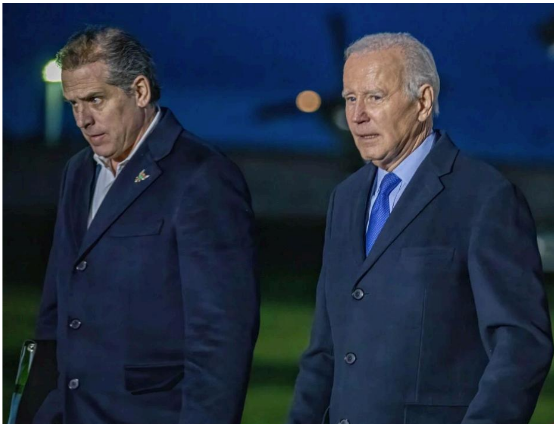
Hunter and President Joe Biden.