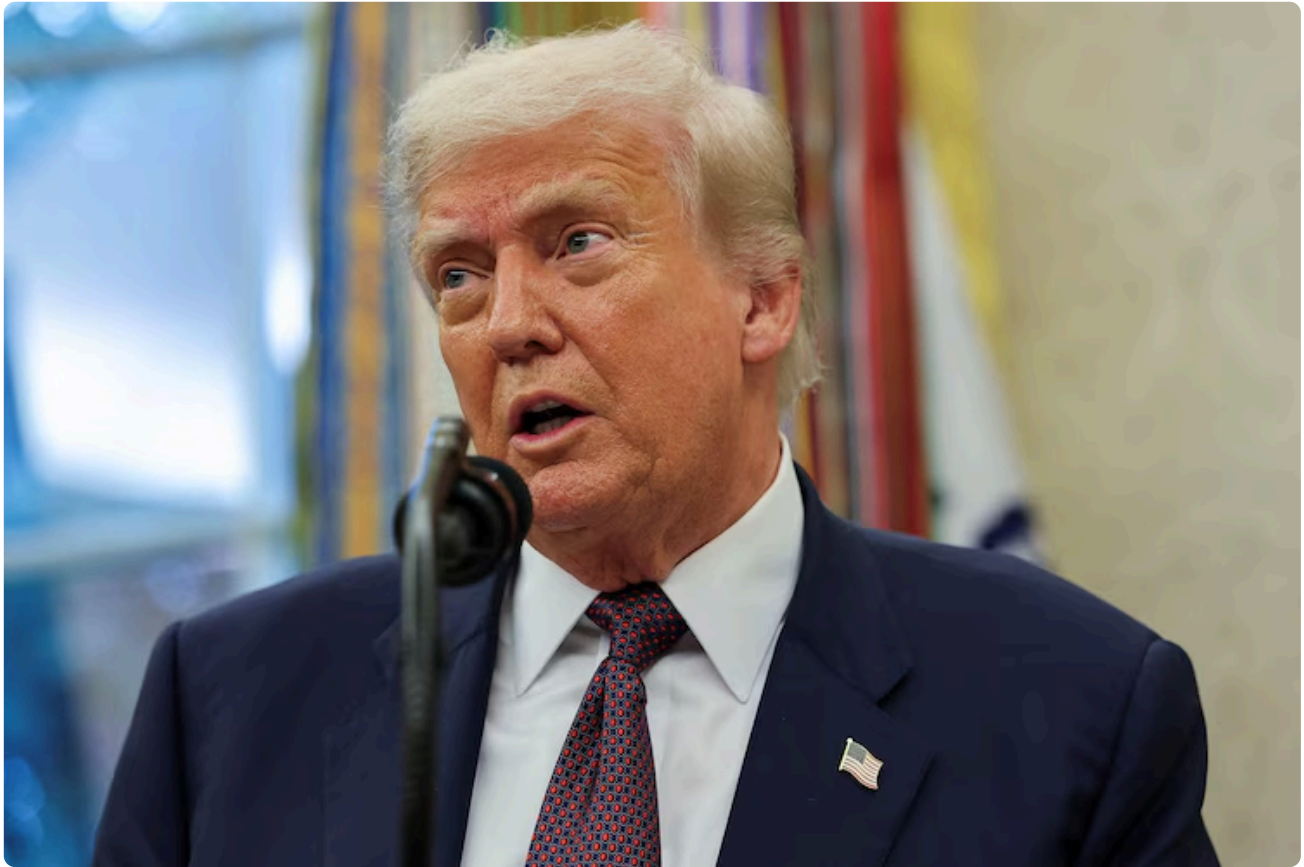
President Donald Trump speaks in the Oval Office of the White House in Washington, Aug. 6, 2025.

Trump said in a social media post that the incident showed that "crime in Washington, D.C., is totally out of control." The president also suggested that minors involved in such crimes should be prosecuted as adults, "starting at 14."