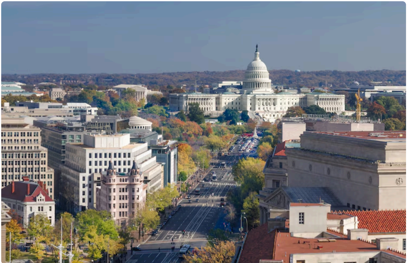
Washington D.C. skyline with Capitol Hill.

Homicides in Washington, D.C., rose from 166 in 2019 to 226 in 2021 and climbed to 274 in 2023, according to crime stats from the Washington, D.C., Metropolitan Police Department.