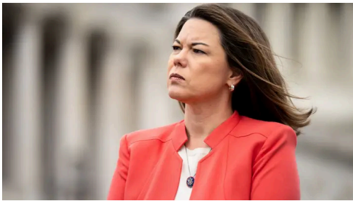
Rep. Angie Craig, D-Minn., participates in a news conference outside the Capitol on the Affordable Insulin Now Act vote in the House of Representatives on Thursday, March 31, 2022.

Other recent violent crimes include the 2023 beating death of a homeless man with a metal pipe near the Ellipse in Washington's downtown, and a Metropolitan Area Transit Authority police officer who was stabbed in the face near the D.C. Navy Yard subway station.