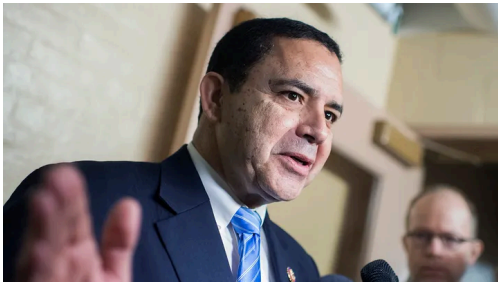
Rep. Henry Cuellar, D-Texas, talks with reporters in the Capitol after a meeting of House Democrats on Thursday, June 27, 2019.

put in jail, "you've got to lock them up and keep them there."