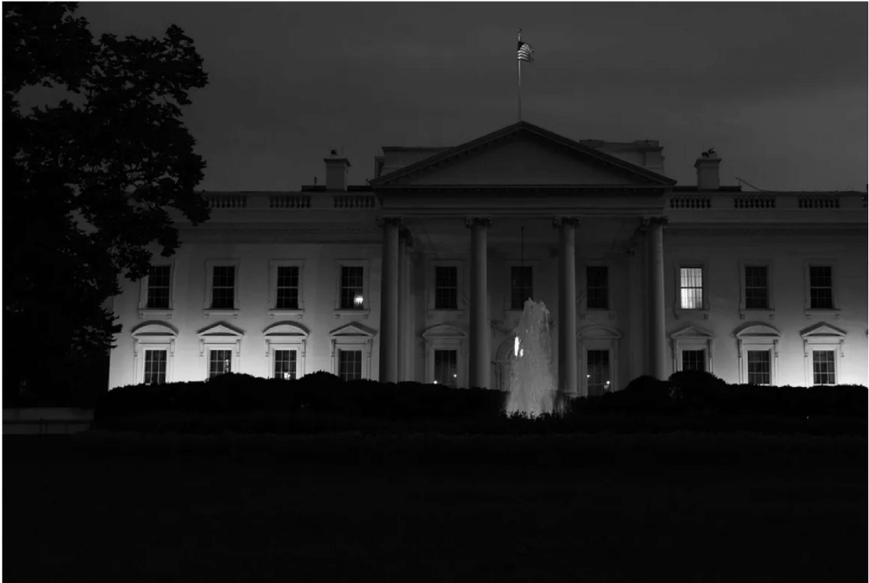
Photographer: Alex Wong/Getty Images Photographer: Alex Wong/Getty Images

BEFORE TAKING OFFICE, TRUMP REPEATEDLY DISMISSED GLOBAL WARMING AS hoax – a position at odds not only with the vast majority of scientists, but also with the longstanding policy of the U.S. government.