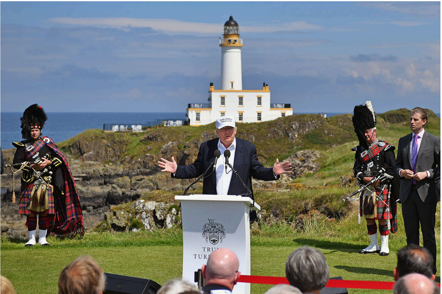
President Donald Trump gives a press conference at his Trump Turnberry Resort in June 2016.