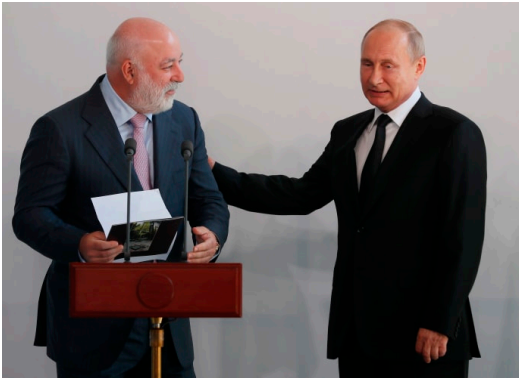
Viktor Vekselberg and Vladimir Putin in 2019.