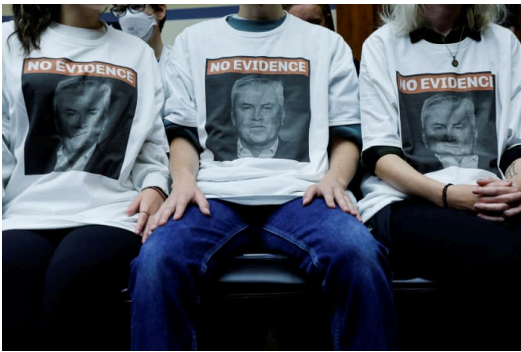
Attendees of a House Oversight and Accountability Committee hearing last fall made their views clear.

note that Bobulinski called “a lie.” The inconsistencies also include the timeline of when Bobulinski first learned of the Chinese company involved with the business deals, with Bobulinski telling Democrats that the FBI’s notes about that timeline were also “incorrect.”