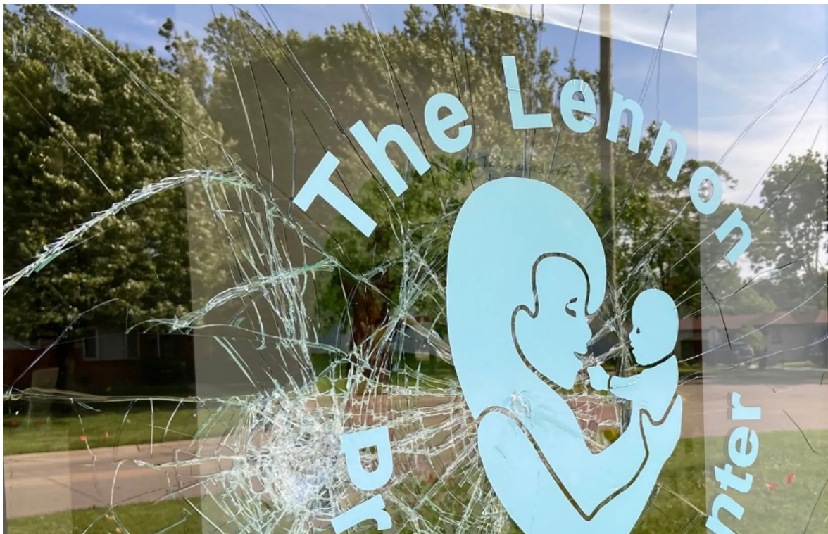
The Lennon Pregnancy Center in Dearborn Heights, Michigan, was vandalized with its windows smashed and walls spray-painted.

At least 58 other pro-life clinics and organizations suffered the same fate, according to the same report.