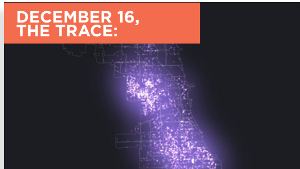
'Surviving the Survival' of Living Through a Shooting