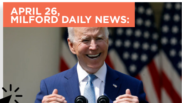
Joe Biden confronts the dueling pandemics of COVID and gun violence