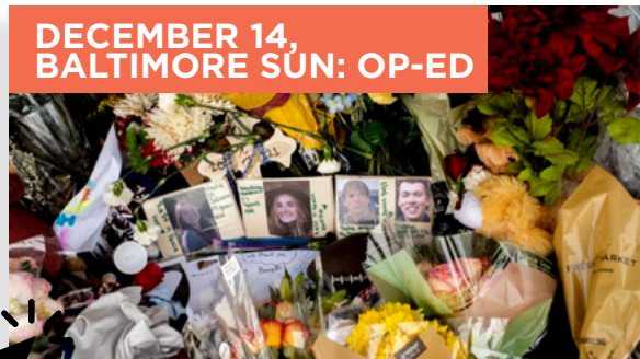
Media inconsistent in telling the stories of gun violence victims | GUEST COMMENTARY