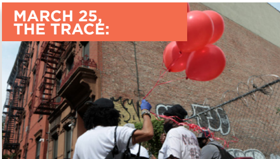
The Way We Think About Mass Shootings Ignores Many Black Victims

Media plays a major role in influencing and driving policy changes. In 2021, we began efforts to call out the bias and inconsistencies in how violence is covered in communities of color versus white communities in America. By highlighting these inconsistencies, we began to call out how the media criminalizes and dehumanizes Black and Brown folks impacted by violence, which in turn overly emphasizes crime control approaches.