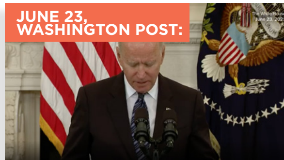
Biden lays out strategy to tackle rising homicides