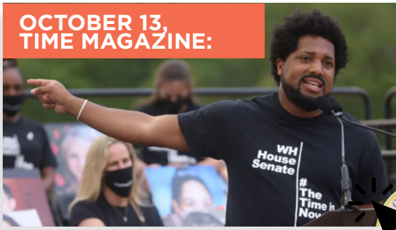
He Was Shot by a Stranger but Treated Like a Criminal When He Reached the ER

Ending gun violence starts with supporting those most directly impacted by this crisis. By highlighting the story of our Executive Director, we were able to elevate the toll that our broken criminal legal system and health system has played to fuel violence by neglecting or worse, criminalizing, gun violence victims of color. In Time Magazine, we were able to elevate this issue to an international audience, while further emphasizing the need to strengthen the health response to gun violence in our communities.