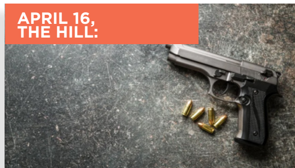
How to apply COVID-19 lessons to outbreak of gun violence