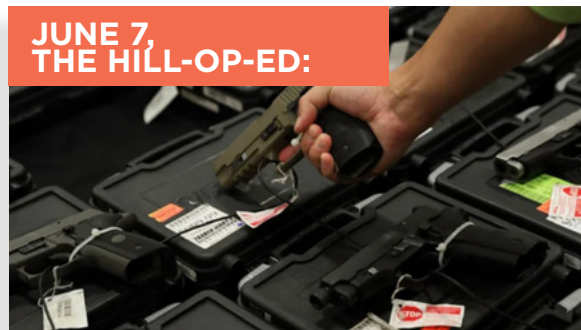
Just like COVID-19, gun violence is a public health crisis