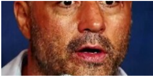
The Anti-Joe Rogan Mob Continues To Feed On The Controversy Nationalreview.com