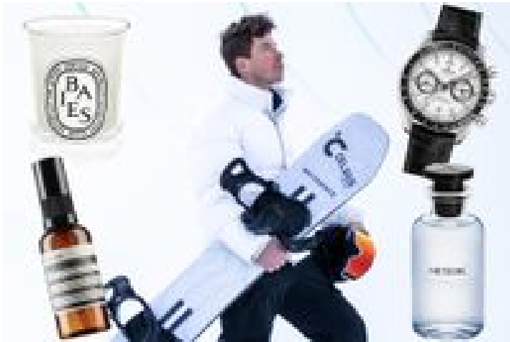
Shaun White shares his Olympics 2022 essentials Page Six