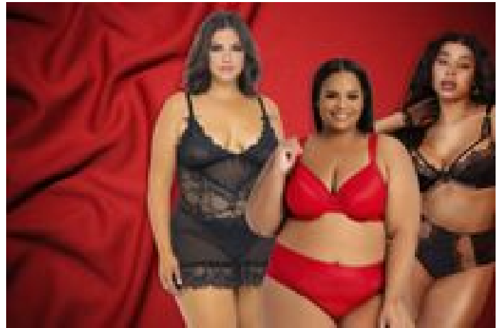
16 best plus-size bra and bralette that are comfortable and... New York Post