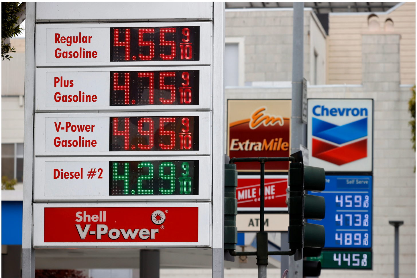
High gas prices seen at a station in San Francisco, California on July 12, 2021.

Biden last year issued a wide-ranging moratorium on new oil and gas leases on federal land pending a review of its environmental and climate impacts.