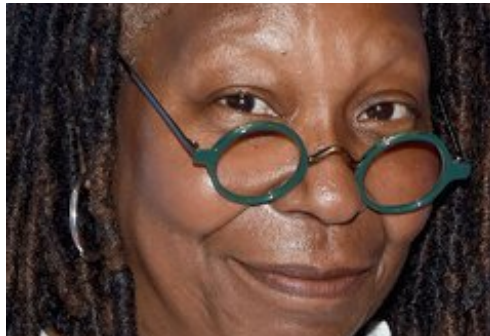
The Real Reason Whoopi Goldberg Was Suspended From The View Aol.com