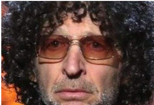
The Tragedy Of Howard Stern Isn't Just Sad, It's Heartbreaking NickiSwift.com