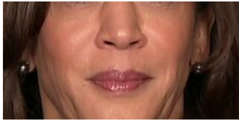
Unsettling Details Revealed About Kamala Harris In Capitol Riot NYPost.com