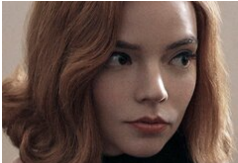
Netflix Loses $5M After Offensive Depiction In Queens Gambit NYPost.com