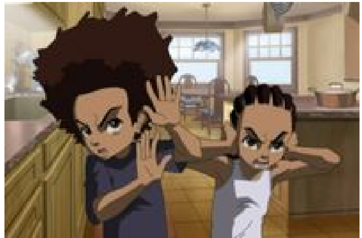
'The Boondocks' Reboot Series Canceled at HBO Max Decider