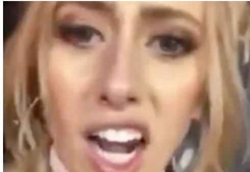
Things Just Keep Getting Weirder For Patrick Mahomes' Fiancée