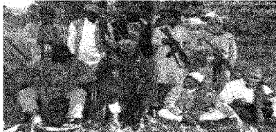
Senegalese “colony” in Sirte, Libya under “Islamic State in West Africa Province” (2016) 4

In late 2015, in addition to Boko Haram (and Ansaru) members “migrating” to Libya, there were also Senegalese funding networks of Boko Haram in Niger. This coincided with reports of a Senegalese “colony” in Sirte, Libya, which is under Islamic State control are arrests of a Boko Haram cell in Senegal. The Senegalese ties to Boko Haram may therefore be maturing.