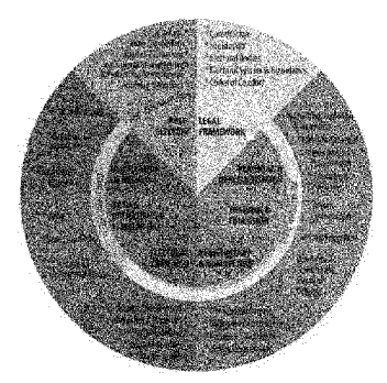
Figure 1: The Electoral Cycle

No team makes it to a championship without hard work in the pre- and regular seasons, as well as some intense post-season analysis and rebuilding. Similarly, although Election Day may be the "Super Bowl" of the electoral cycle (see Figure 1), it is simply one event in a long process.