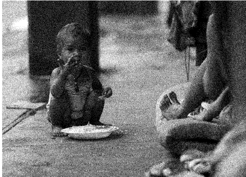
A homeless child in the streets of Manila in 2014.

Pope Francis took the helm of the Catholic Church last year, vowing to refashion the institution “for the poor.” Yet during his recent five-day visit to the Philippines, where he presided over Mass for more than six million rapturous worshippers, it appeared many of the nation’s most impoverished were cruelly banished from view.