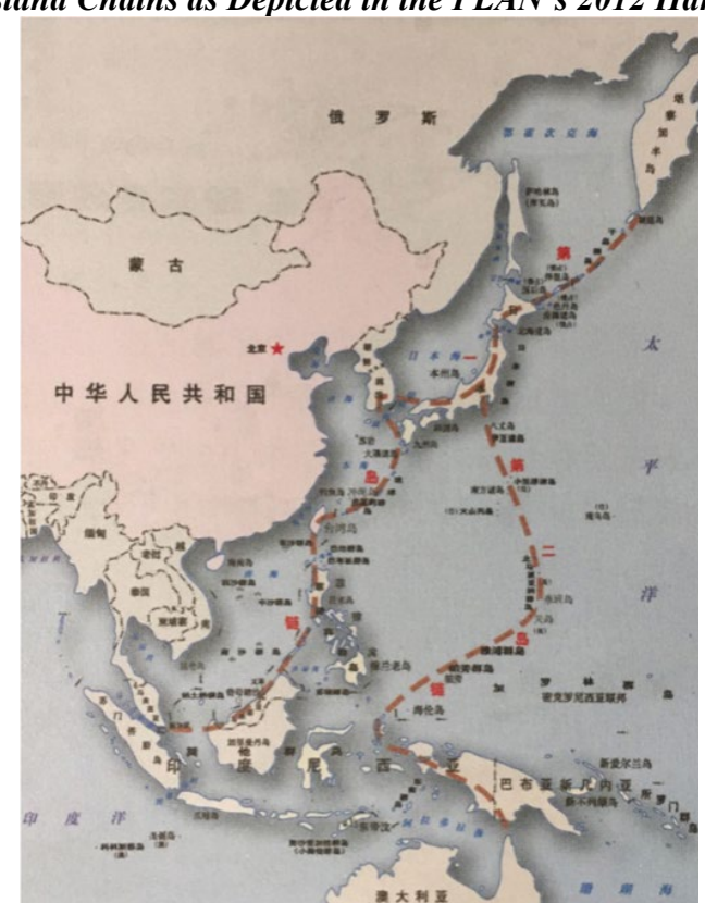
The Island Chains as Depicted in the PLAN's 2012 Handbook

Making things even more difficult for Beijing, as Chinese strategists look beyond the First Island Chain, they see a second one, running from Japan down through Iwo Jima, onward to Guam and the Commonwealth of Northern Marianas, southwards through the Federated States of Micronesia, on to Indonesia and Papua New Guinea, and then to Australia. This is the "Second Island Chain."