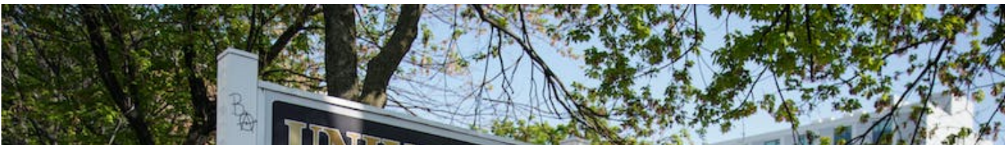
UC Townhomes residents receive assistance ahead of Aug. 15 eviction