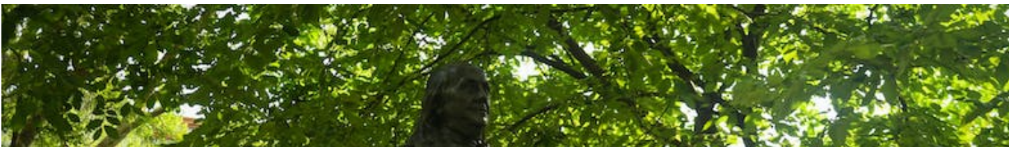
Penn Admissions adds school-specific essay prompts to application