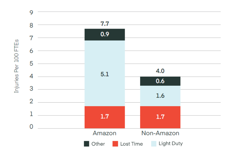
Figure 2 Injury Rates by Type at Amazon and Non-Amazon Warehouses, 2021

A serious injury is one that prevents a worker from returning to her regular job, classified as "light duty" or "lost time." In 2021, Amazon's serious injury rate was over double the rate for non-Amazon warehouses (6.8 serious injuries/100 full-time equivalent workers (FTE's) for Amazon as compared to 3.3/100 for non-Amazon warehouses). See Figure 2.