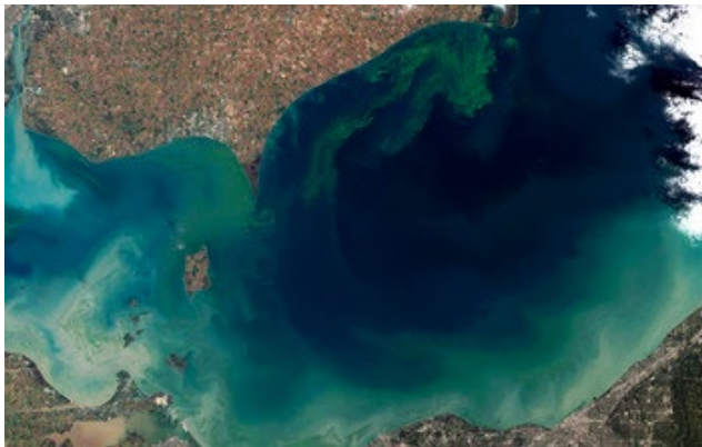
Photo of Lake Erie during Harmful Algal Bloom

In 2014, a massive harmful algal bloom forced Toledo to shut off its water. For days, citizens could not drink, bathe, or cook from the tap. In a modern economy with sophisticated infrastructure, we take ready access to freshwater for granted. But for three days, my region rationed water during this ecological emergency.