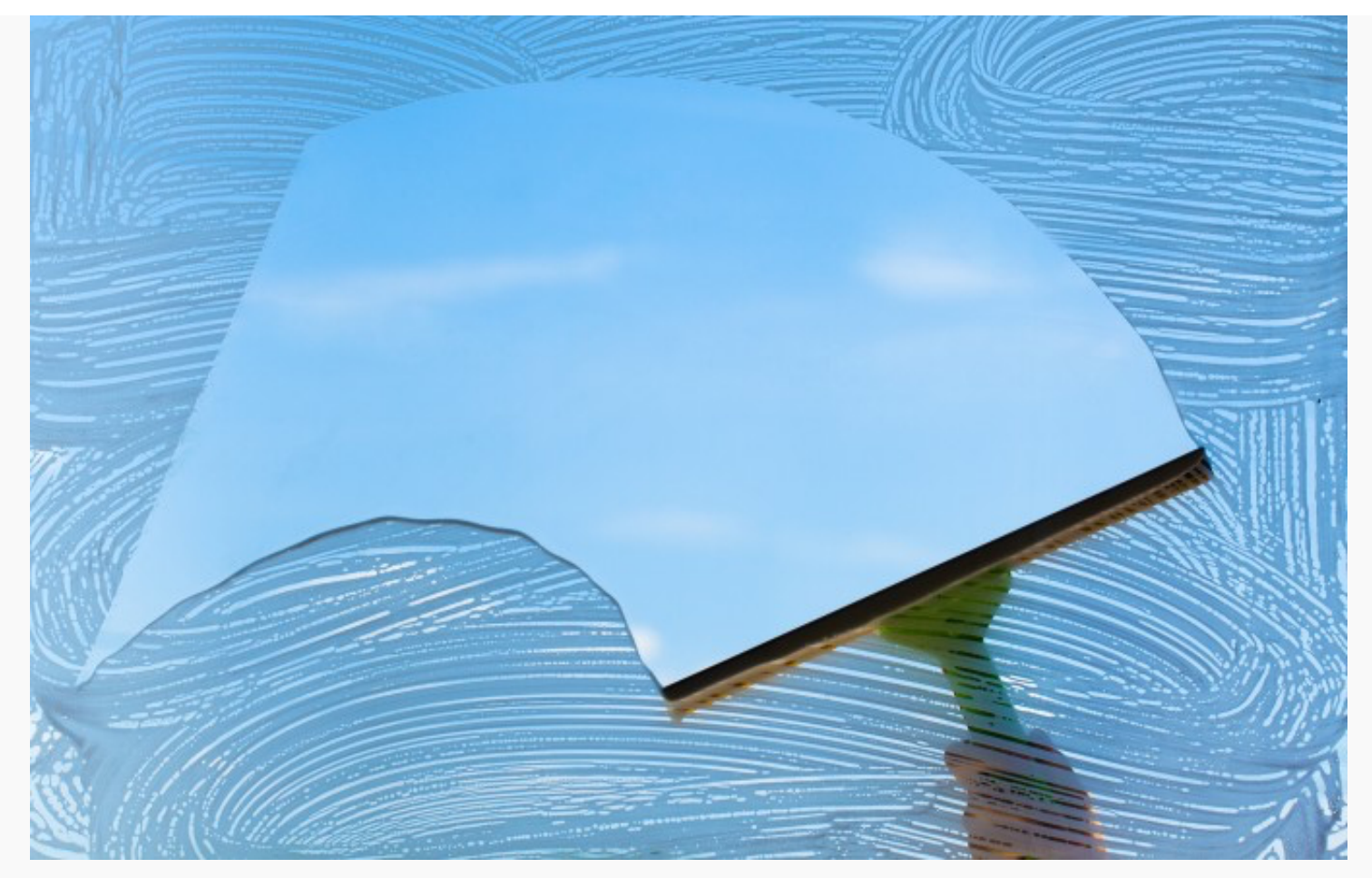
Congress should correct the Second Circuit's mistake in Madden v. Midland Funding and restore clarity to credit markets and access to borrowers who need it.

In fact, courts have cited Nichols and the principle of valid-when-made in other contexts. Perhaps the most direct example is the case of FDIC v. Lattimore Land Corp. In that case, the U.S. Court of Appeals for the Fifth Circuit held that a nonusurious loan made by a nonbank under Georgia law and subsequently transferred to a Tennessee-based national bank did not become usurious, even though it exceeded Tennessee's usury cap, because "[t]he nonusurious character of a note should not change when the note changes hands." The Lattimore court cited to Nichols for the proposition that: