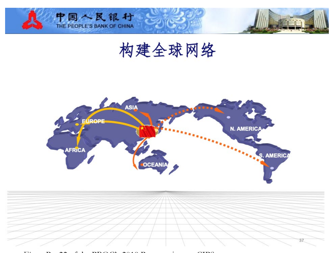
Figure: Pg. 22 of the PBOC's 2018 Presentation on CIPS.

The PBOC likely has plans to enhance the functionality of CIPS so that it will eventually rely on SWIFT less. Out of the basic principles behind CIPS, the PBOC specific that CIPS functionality will be conducive to isolating legal risks in cross-border payment settlement and creating a fair competitive environment.<sup>33</sup> Given the "neutrality" critique on SWIFT especially among waves of financial sanctions on Russia, this seems deliberate on China's part to create a payment system that espouses principles of fairness. The PBOC has intentions to normalize the use of RMB clearing and settlement via CIPS from its 2018 presentation (see below). The orange dashed lines indicate CIPS are transacting with financial institutions in North and South American jurisdictions via SWIFT. The yellow solid lines likely indicate China aims to circumvent SWIFT messaging and settle RMB transactions directly with financial institutions in these regions. How the PRC intends to achieve just that is unclear, but the intention is apparent.