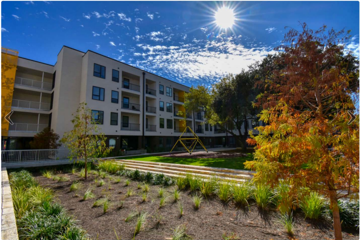
PATHWAYS AT CHALMERS COURTS SOUTH OPENED FALL OF 2019