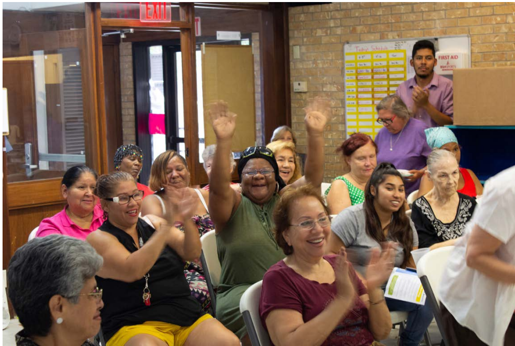
PHOTOS FROM TWO OF THE MANY RESIDENT MEETINGS TO DISCUSS RAD PROGRAM