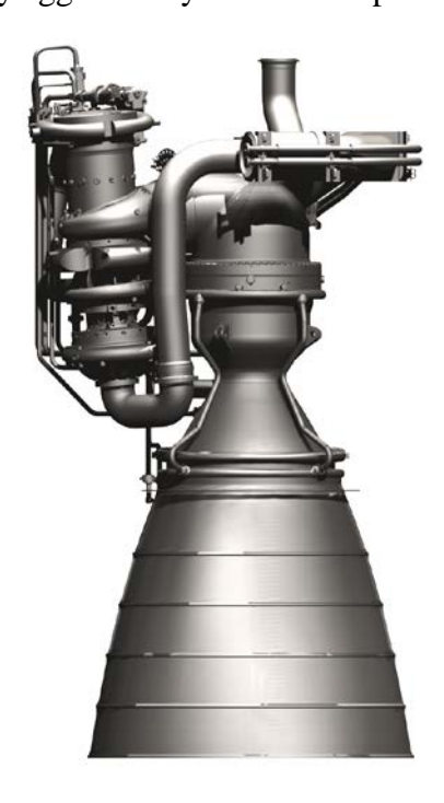
Blue Origin BE-4 Engine

Last summer, we entered a strategic relationship with Blue Origin, founded by Amazon.com's Jeffrey Bezos, to develop the BE-4 liquid natural gas rocket engine. We partnered with Blue Origin for several reasons. The BE-4 engine's high-performance, low cost, and potential reusability made it very attractive. Also, given the urgency to transition from Russian supplied engines, Blue Origin's design was fairly mature since it was already 3 ½ years into development. Engine component testing is currently underway. The next major milestone will be testing of the turbo pumps and valves. Full-up engine testing is scheduled to begin in 2016. Finally, the BE-4 engine development is fully funded by industry. As a commercial development, we can move very aggressively toward completing the new engine.