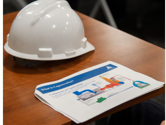
THE AOC'S RISK-BASED PROJECT PRIORITIZATION PROCESS STRATEGICALLY IDENTIFIES PROJECTS

Adhering to a plan is important to me. Each year we use a risk-based process to prioritize needed projects. In FY 2020, we are requesting $175 million for projects that will provide necessary maintenance to our energy delivery infrastructure, facilitate the next presidential inauguration as well as enhance security measures around the campus.