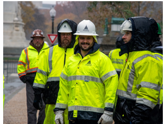
RESOURCES ARE NEEDED TO KEEP PACE WITH GROWING OPERATIONAL AND PROJECT SUPPORT REQUIREMENTS

With the expansion of new responsibilities and the ongoing and planned construction of new facilities both on and off campus, additional in-house resources are needed to lead and manage increasing campus-wide project design and development, construction oversight and project management requirements. Personnel are required to reduce contract award and administrative lead times, and to avoid project delays and cost overruns. As our campus ages and our systems are updated, we need better support for emergency response, fire safety inspection efforts and oversight of fire and safety operations.