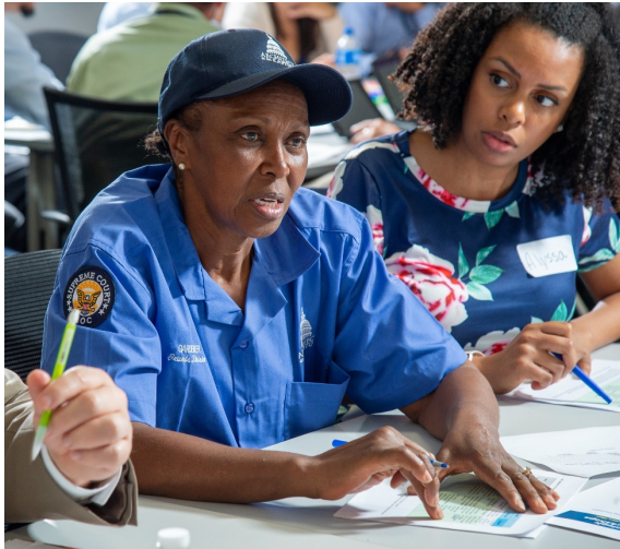
AOC EMPLOYEES ARE HIGHLY SKILLED, WELL-TRAINED AND EXTREMELY DEDICATED

The AOC has some of the most talented and widely admired craftsmen, tradesmen, artists, architects,