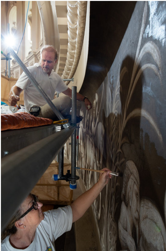
CONSERVATION WORK ON THE ROTUNDA FRIEZE

Our heritage assets include buildings, monuments, landscapes, fountains, fine art, archival records and botanic assets. Their value is priceless. Over the last several years, we have expanded our foundational preservation documents, including building preservation guides and cultural landscape reports. We use these documents and our historic preservation policy as planning tools for restoring, renewing and reclaiming our heritage assets to a standard that is appropriate for the nation's capital and the worldwide symbol of American democracy.