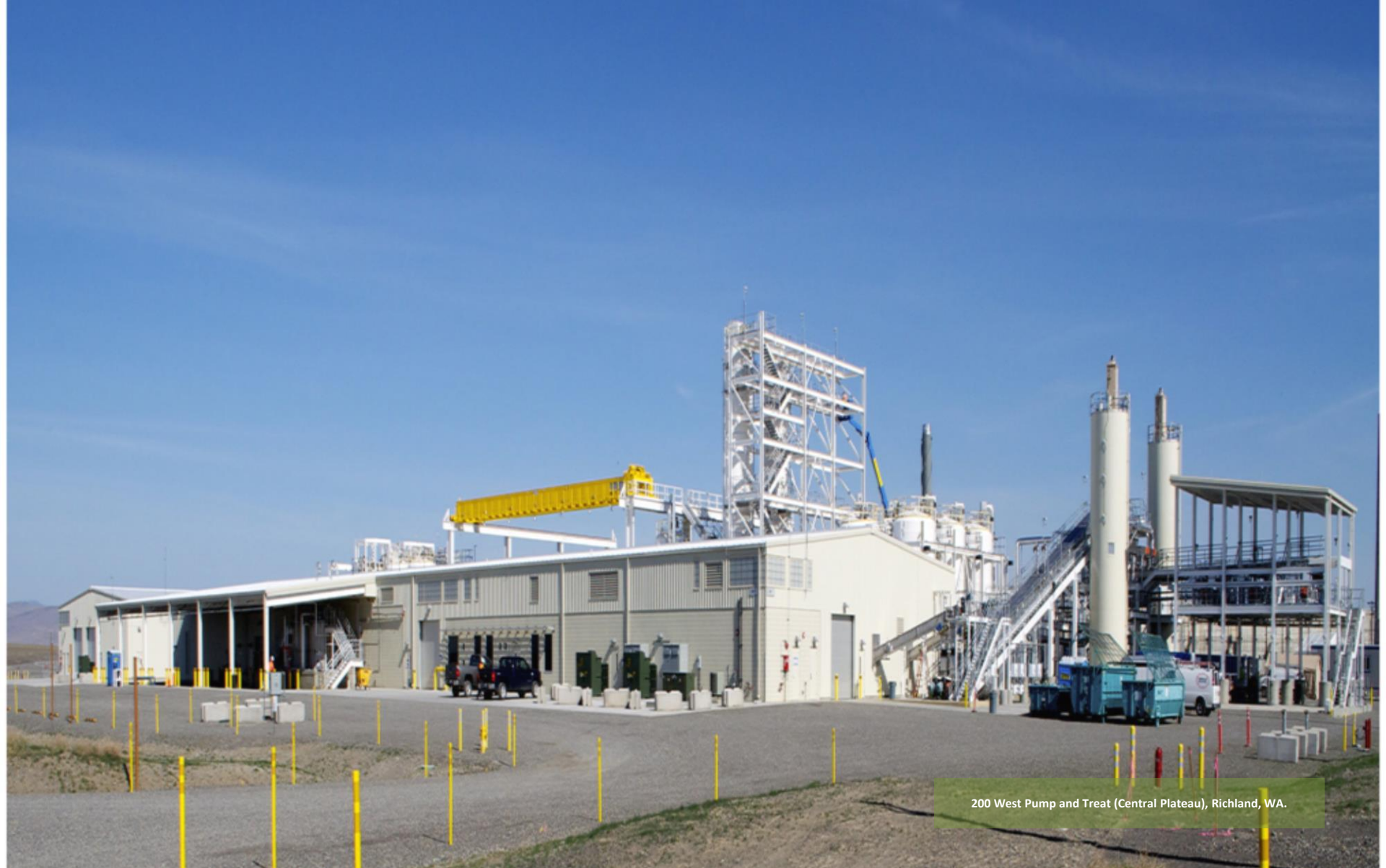
200 West Pump and Treat (Central Plateau), Richland, WA.