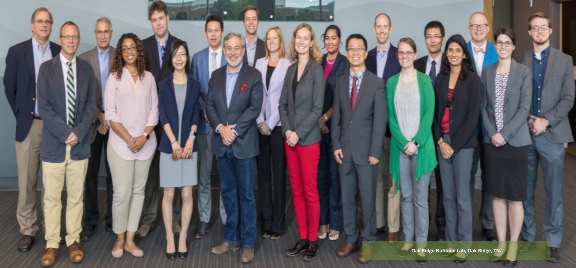
Oak Ridge National Lab, Oak Ridge, TN.