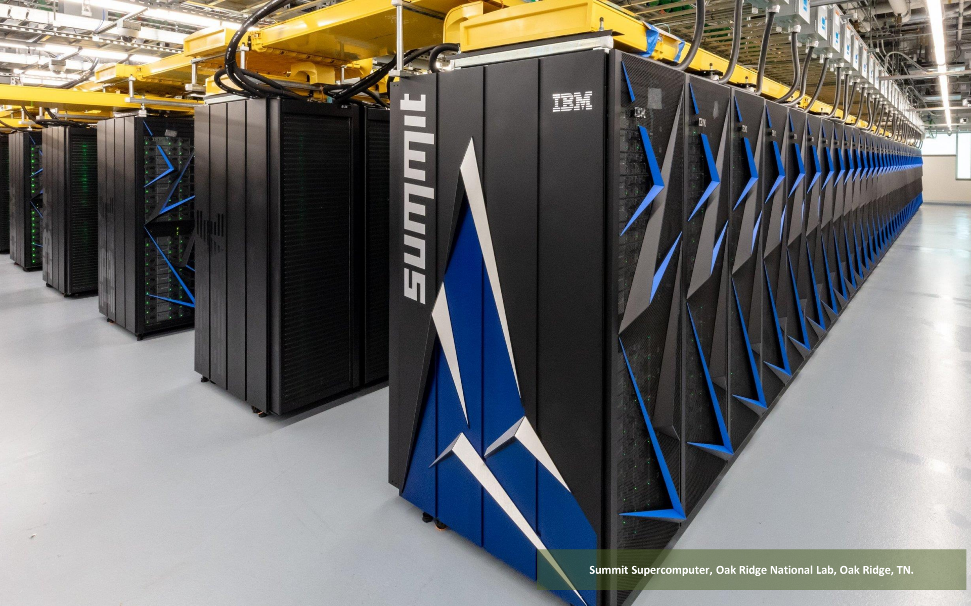
Summit Supercomputer, Oak Ridge National Lab, Oak Ridge, TN.