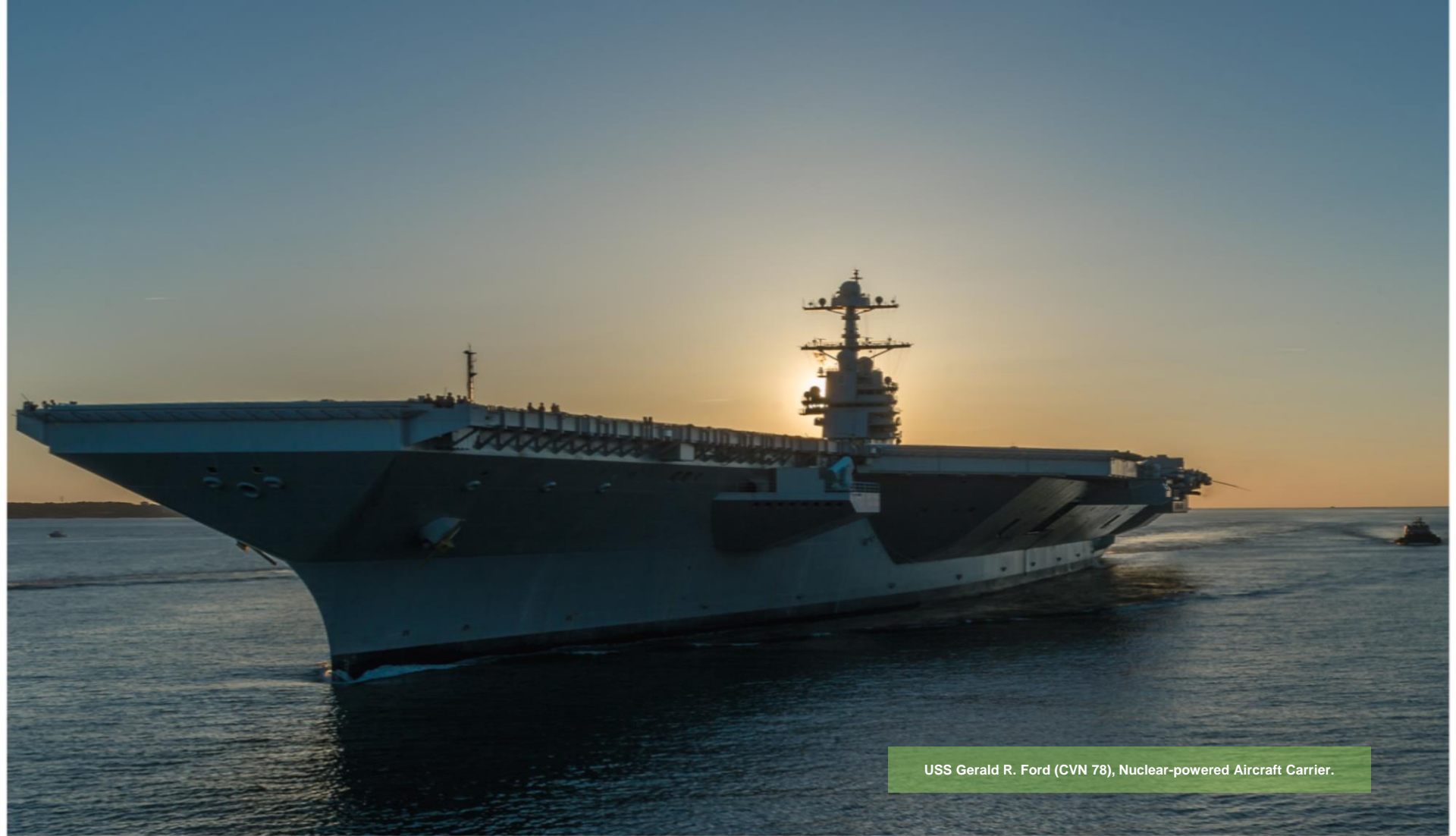
USS Gerald R. Ford (CVN 78), Nuclear-powered Aircraft Carrier.