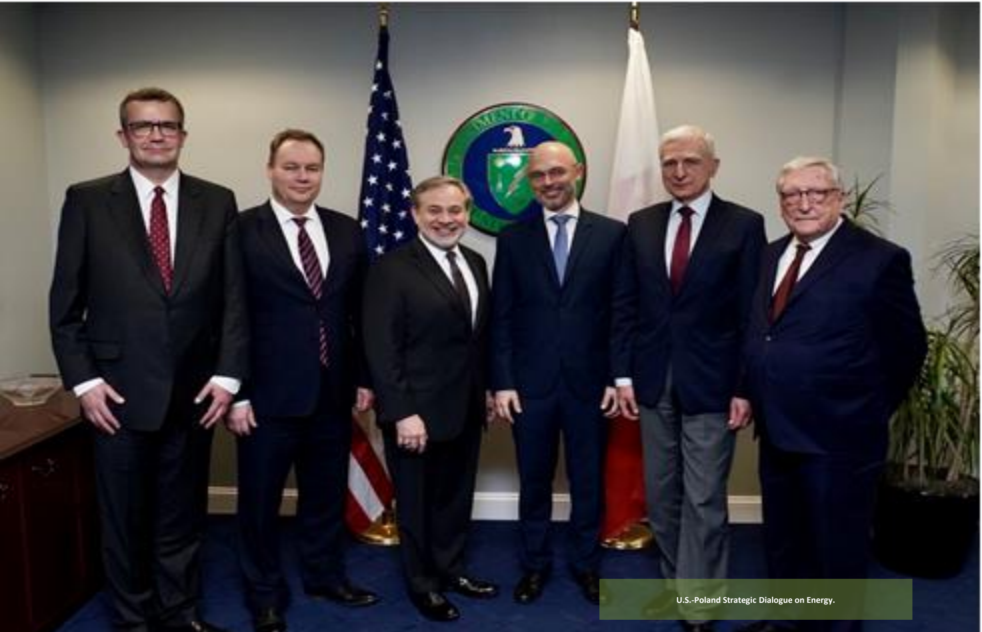
U.S.-Poland Strategic Dialogue on Energy.