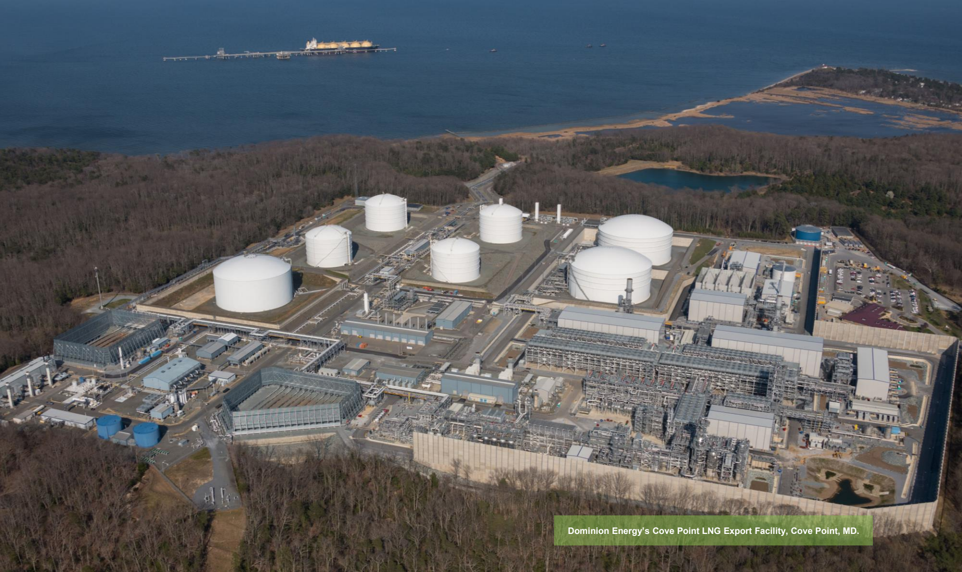
Dominion Energy's Cove Point LNG Export Facility, Cove Point, MD.