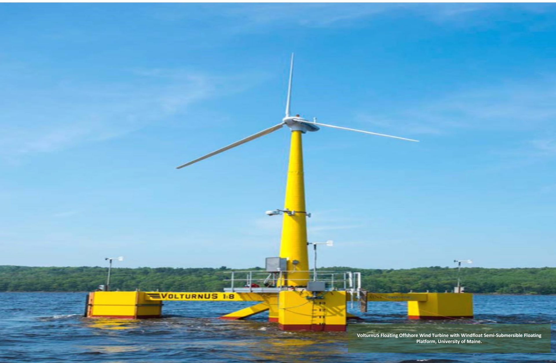
VolturnUS Floating Offshore Wind Turbine with Windfloat Semi-Submersible Floating Platform, University of Maine.